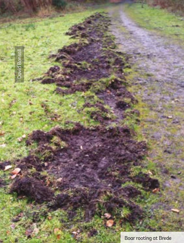
Boar rooting at Brede