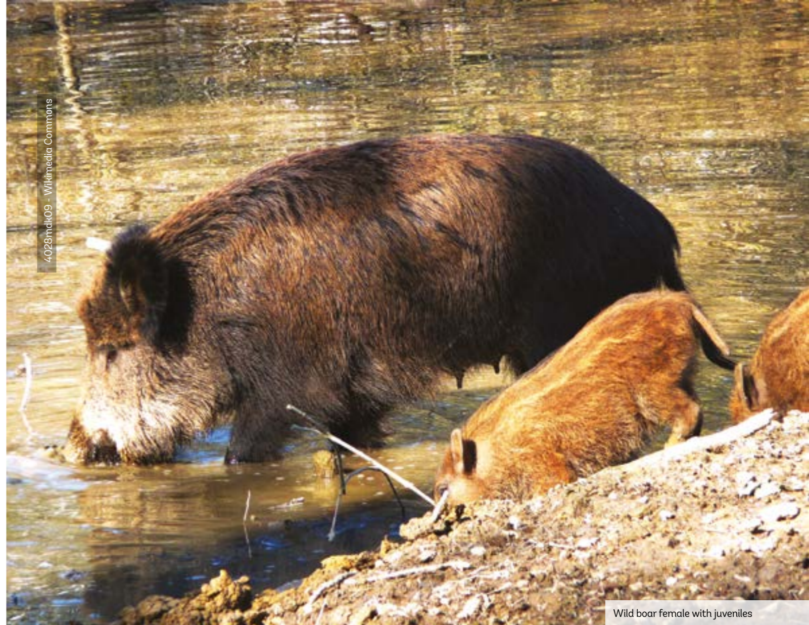
Wild boar female with juveniles

debate around rewilding, and in particular the focus on reintroduction of species such as wolf, Canis lupus , and lynx, Lynx lynx , creates polarised positions. Some relish the idea of these iconic animals populating our landscapes once more, while others focus on the possible threats to human livelihoods and wellbeing.