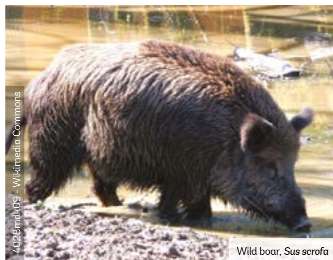
Wild boar, Sus scrofa

In the UK we have been devoid of species that pose us any serious threat for hundreds of years, so our countryside and way of life has changed in response. The current