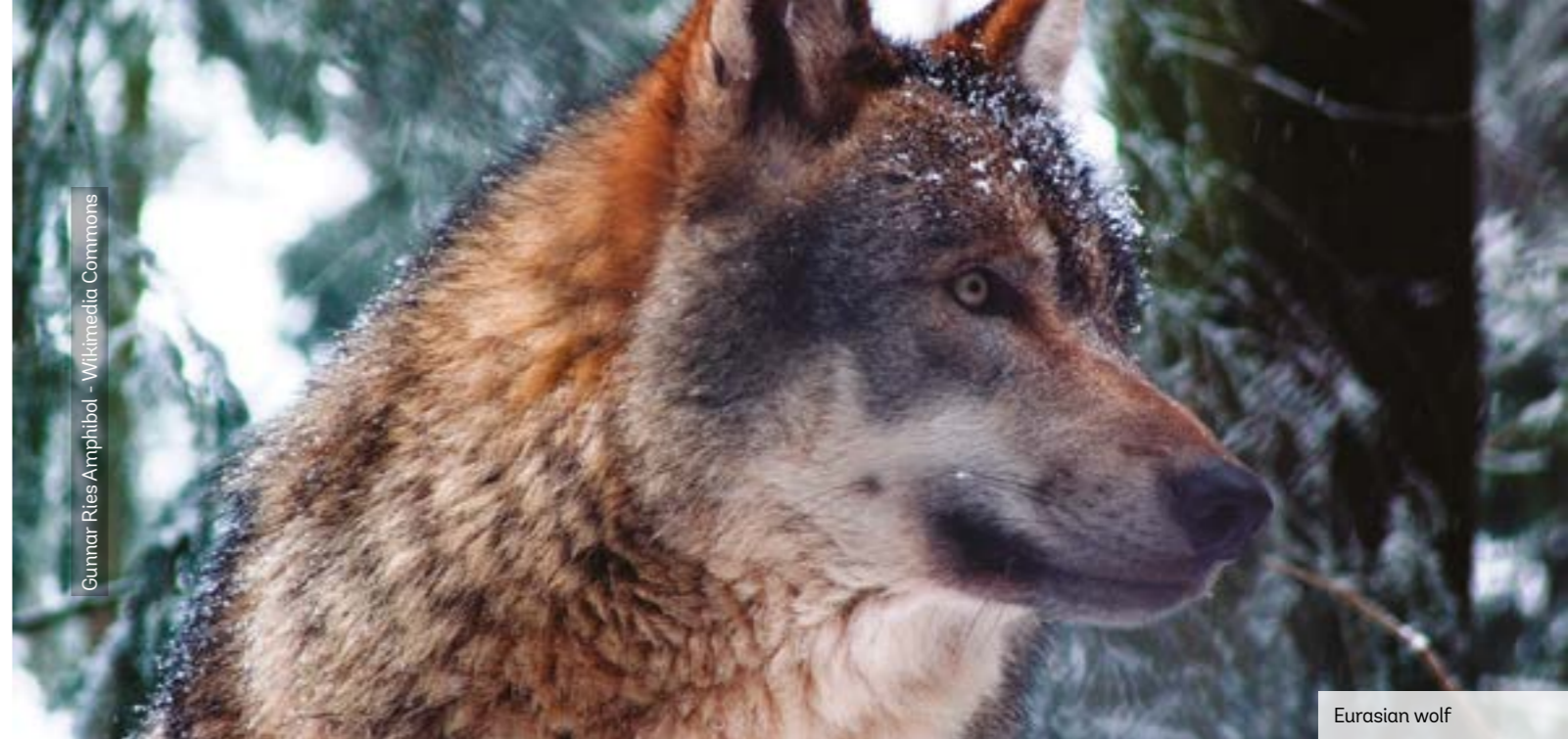
Gunnar Rtes Amphibol - Wikimedia Commons

Cover photo: Hedgehog-northeastwildlife.co.uk