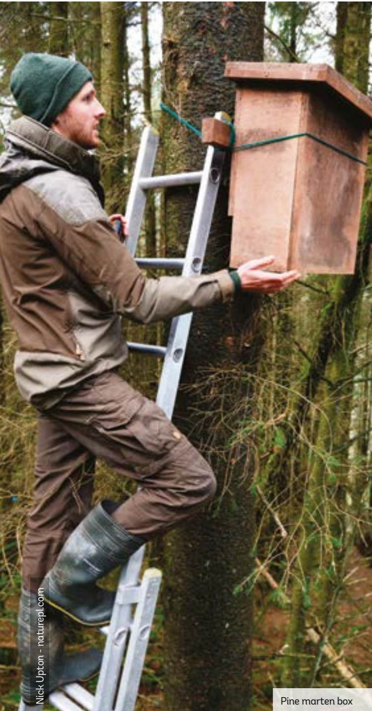
Nick Upton - naturepl.com