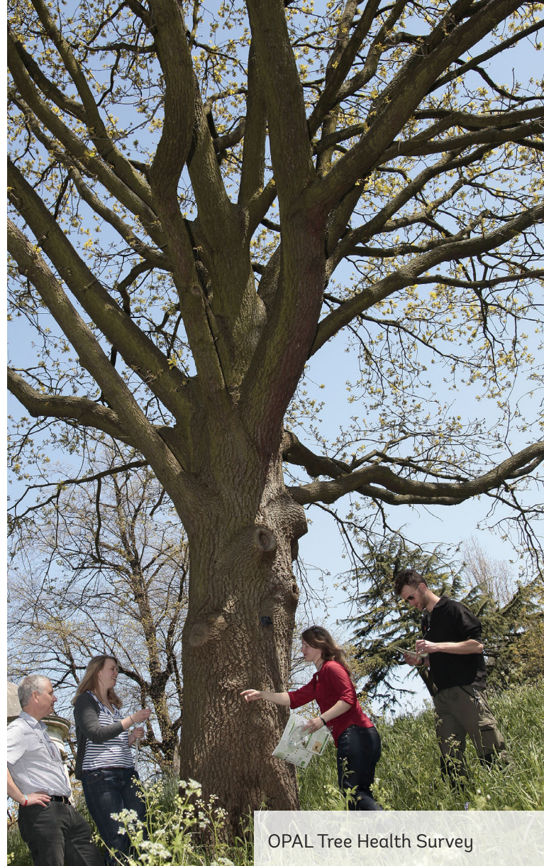
OPAL Tree Health Survey

There are only a small number of dedicated inspectors and researchers tackling this huge and diverse issue. They need help and citizen science