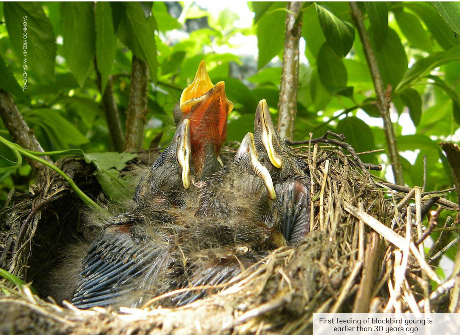
First feeding of blackbird young is earlier than 30 years ago

The project aims to use the valuable data collected by volunteers to better understand the seasonal timing of UK woods and how climate change could affect them. It was necessary