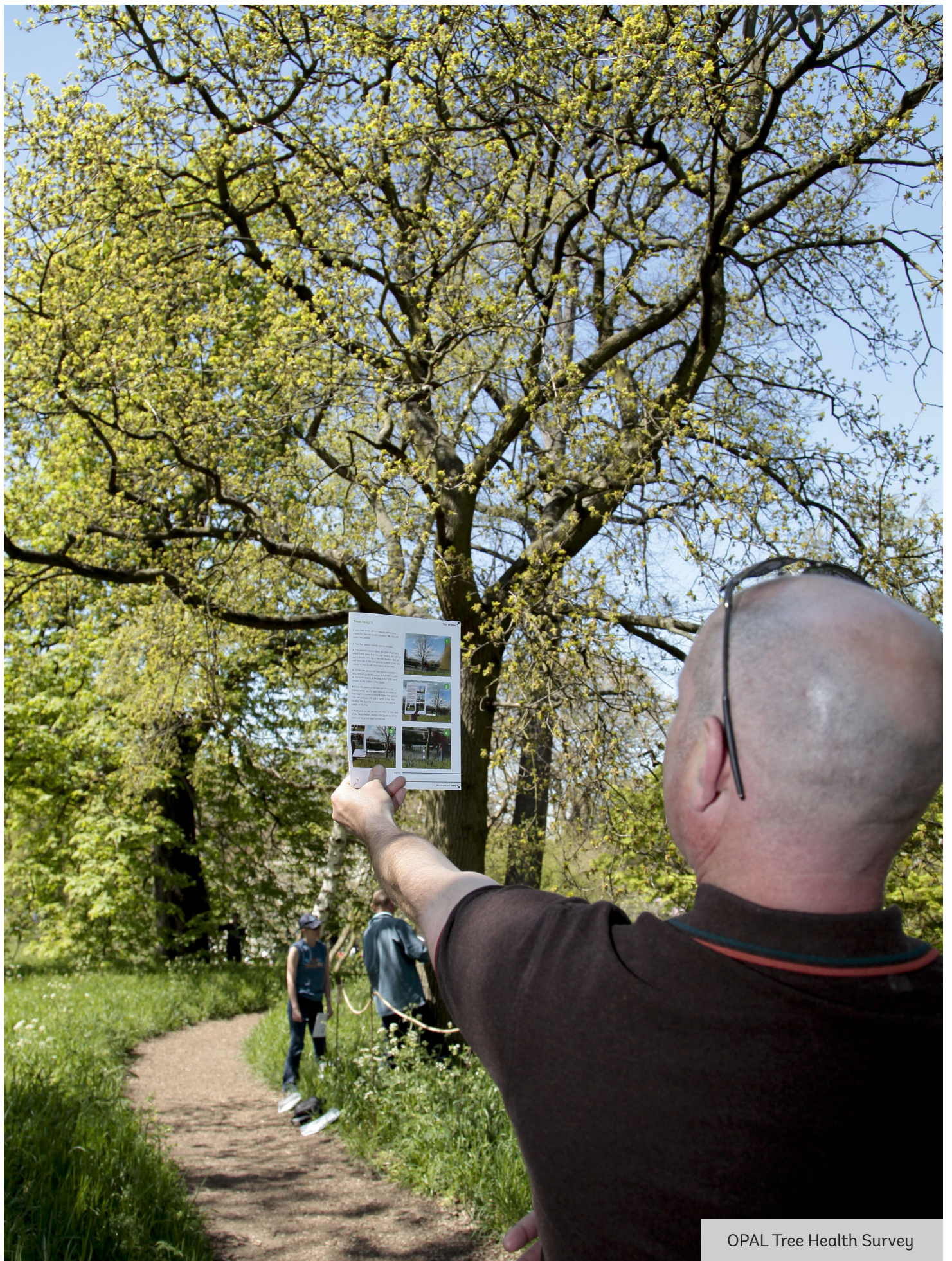
OPAL Tree Health Survey