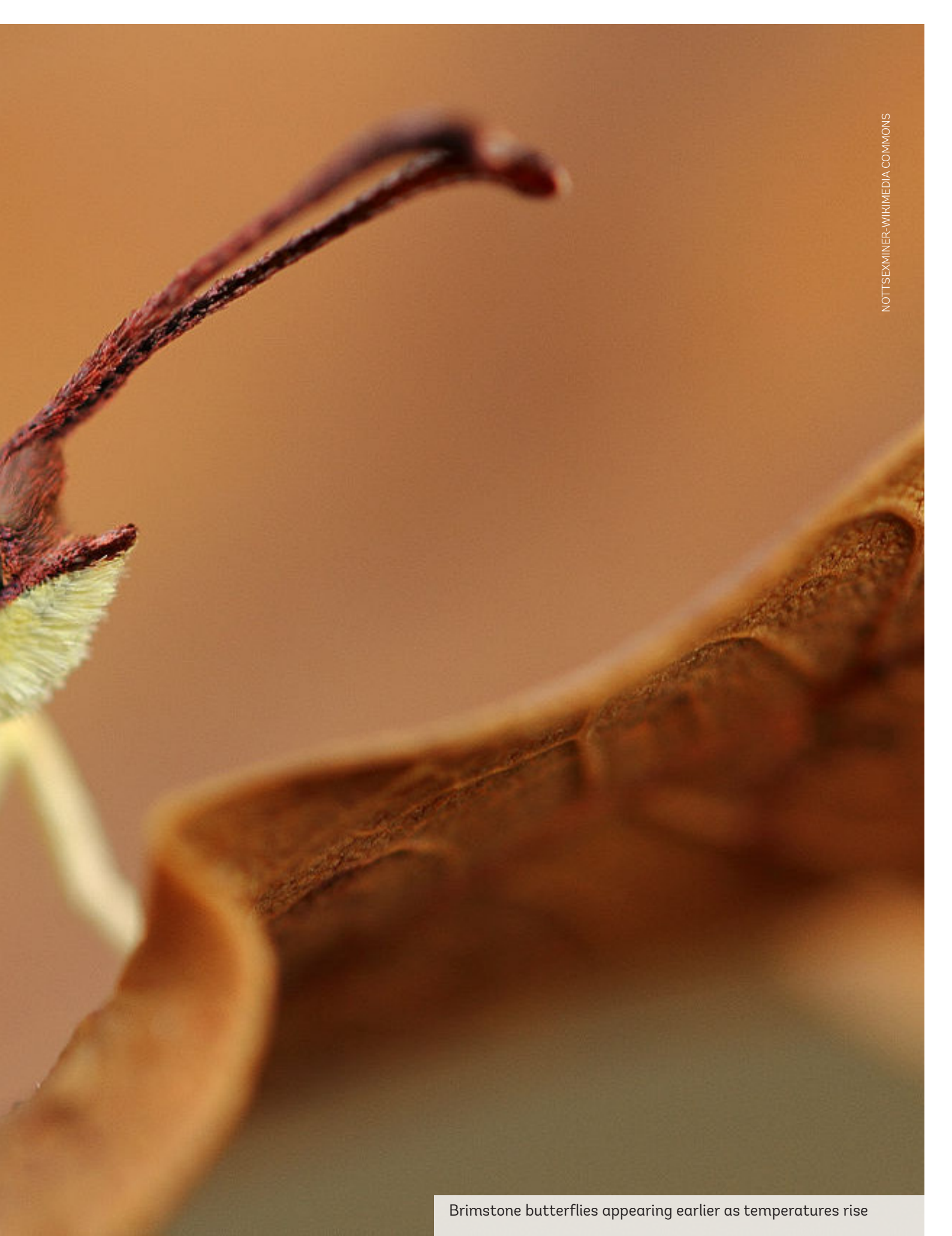
Brimstone butterflies appearing earlier as temperatures rise