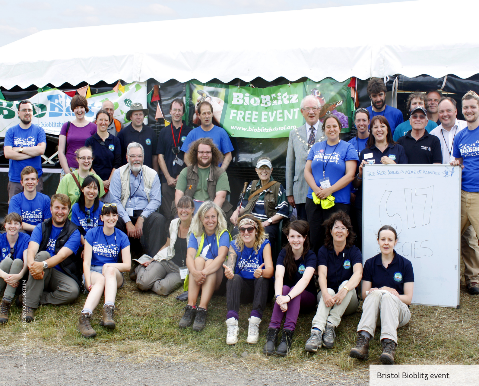
Bristol Bioblitz event