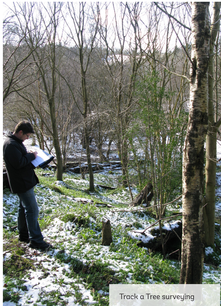
Track a Tree surveying