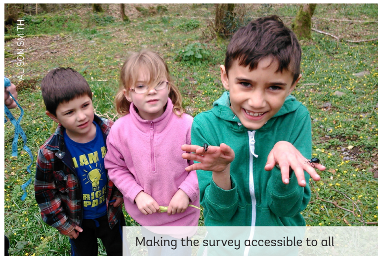
Making the survey accessible to all

A third evolving aim is creating a simple measurement toolkit that can be used by citizen scientists in their local woods – cheap and easy methods that can be used far and wide by volunteer groups, schools and local communities.