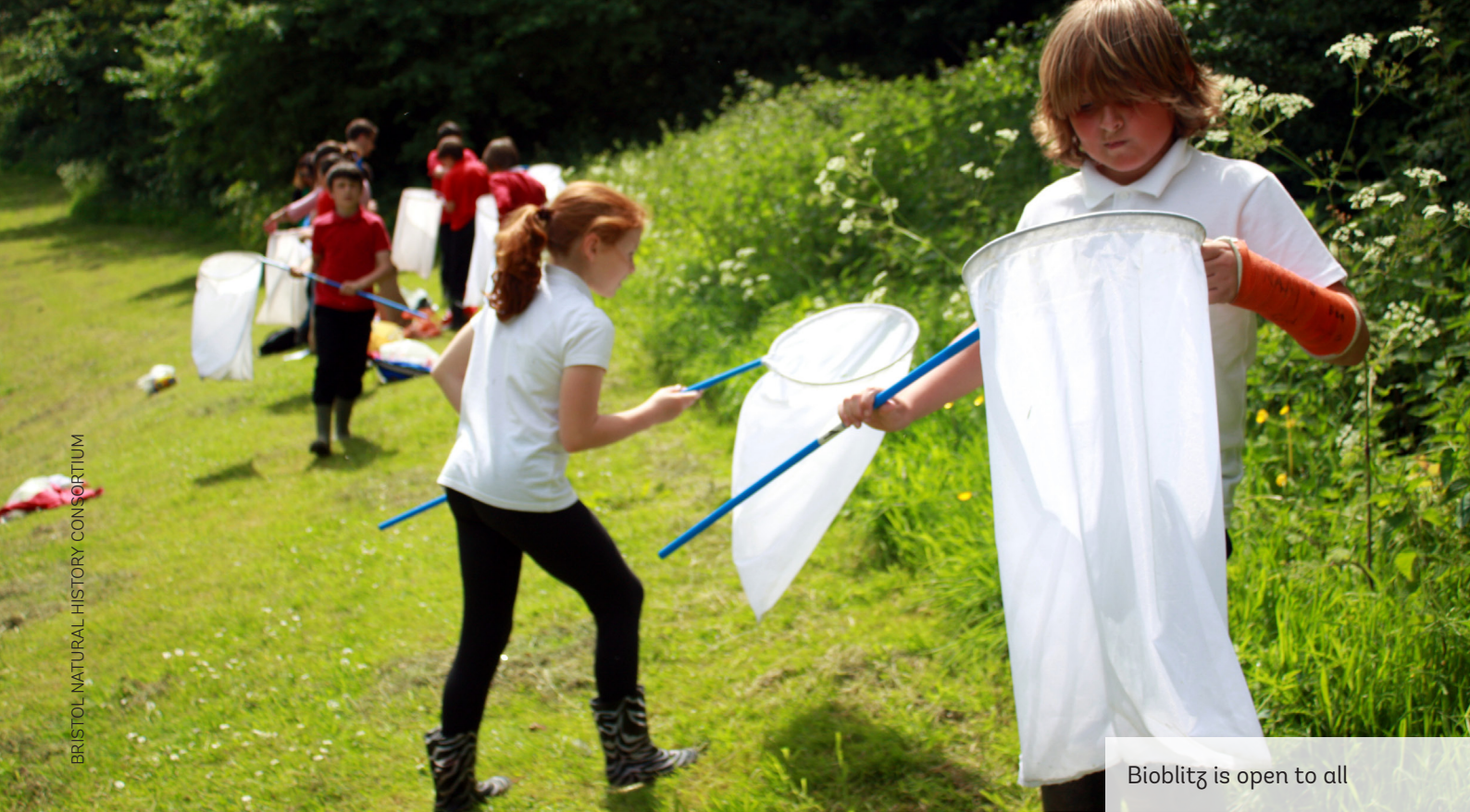
Bioblitz is open to all

many species as they can. Although events can range from smaller, shorter ones, to the bigger 24 hour ones, to huge 30 hour events that get students involved by including part of the school day.