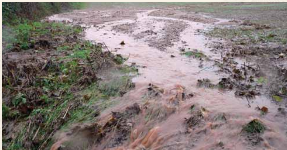
Severe surface water run-off on an arable farm