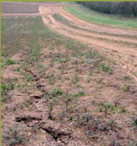
Soil erosion on a sloping field on Haywood Oaks Farm

Richard and Andrew contacted the Woodland Trust and, with help from an adviser, they identified several areas for planting that could not otherwise be utilised due to less favourable growing conditions. During the winter of 2014/15, 4,000 trees were planted, amounting to one hectare across varying areas of the farm, with a further 0.2 hectares