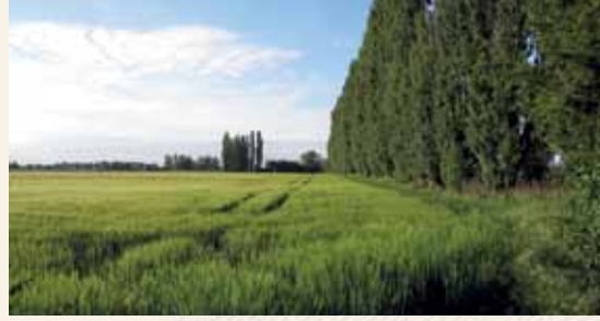
Crops protected by a shelterbelt.

However, trees could act as an insurance policy against droughts. Field edge or in-field shelterbelts modify the crop