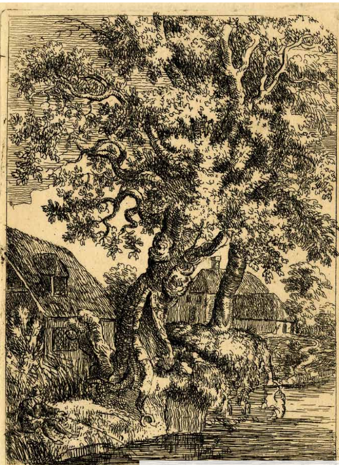
Rural landscape with ancient tree by Artist Paul Sandby

Open-grown trees generally have short, squat, fat trunks with large diameters and spreading limbs, some of which can be almost horizontal. They also have large dome-like crowns. These features are unlikely to develop in more closely