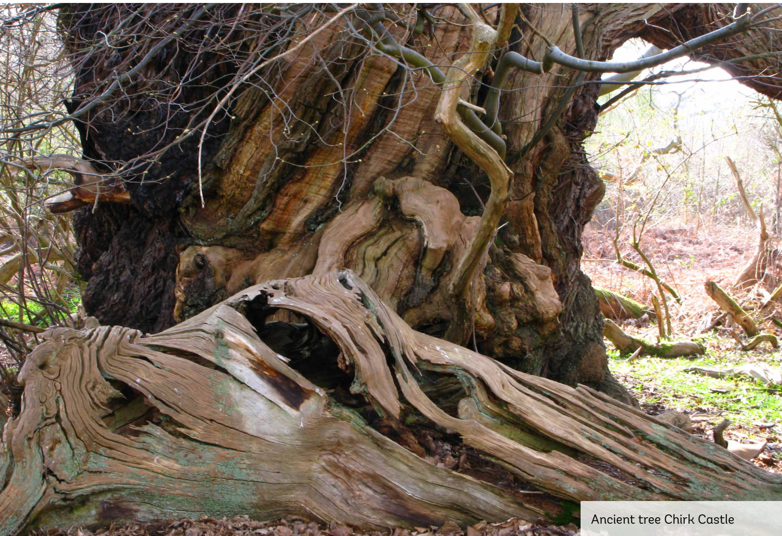
Ancient tree Chirk Castle

This work is an important step in bridging the gap, for some species, in a landscape lacking in a sustainable population of ancient trees. But we also need greater protection for those ancient trees we have and more ancient trees must be allowed to develop and survive to replace those we lose. Trees work on much longer timescales than the ordinary human life. We must adjust our thinking accordingly and support these magnificent giants.