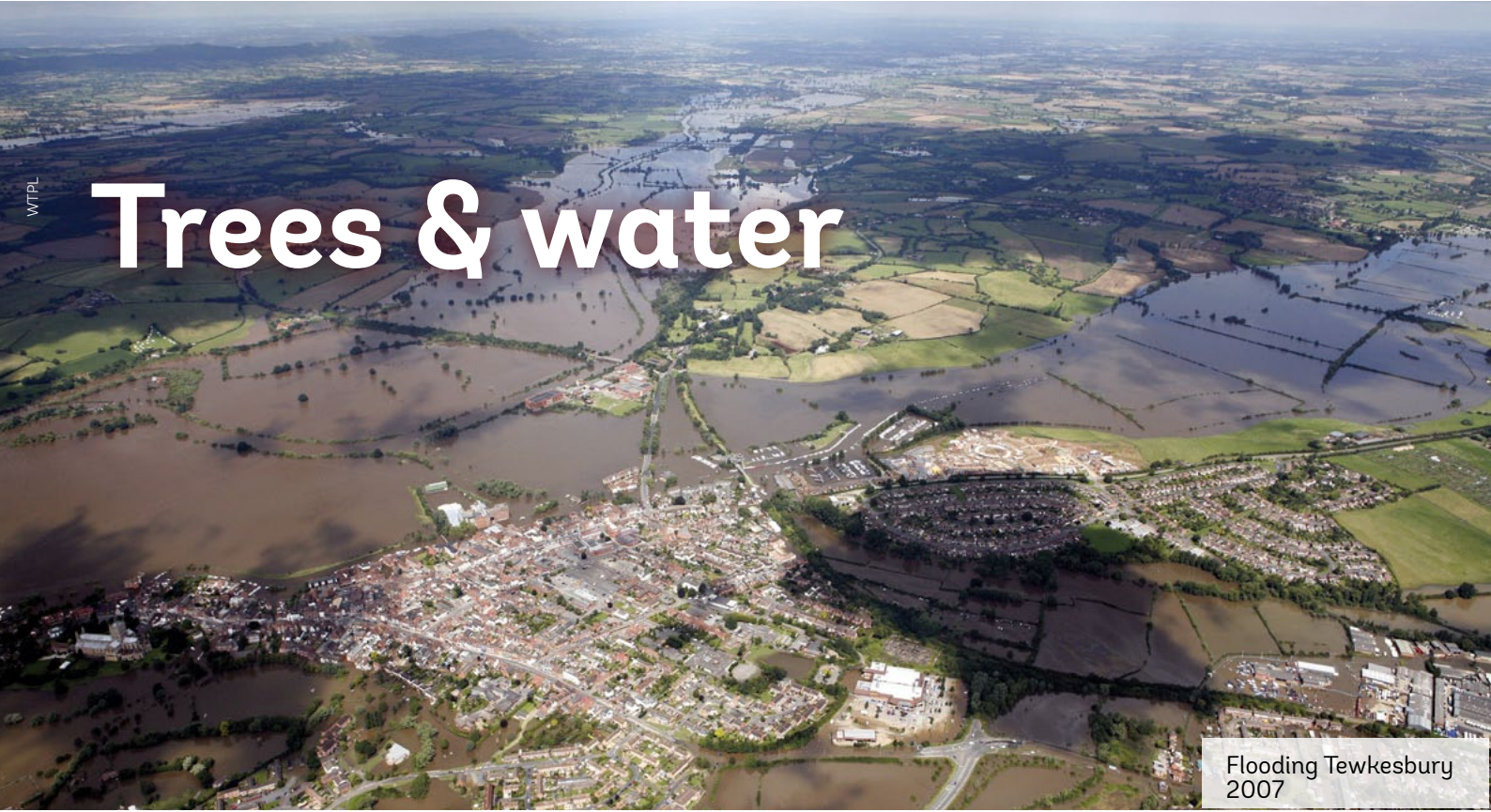
Flooding Tewkesbury 2007

Water is a precious resource for life on Earth, covering 70 per cent of the planet's surface. Yet only 2.5 per cent of the total volume of the world's water is fresh and less than 1 per cent of this is usable by ecosystems and humans – most is trapped as ice (for the time being). Overconsumption is a major issue for many important resources. The UN estimate we would need 3.5 planet Earths to sustain the global population if everyone consumed at the rate of the average European or North American. 1