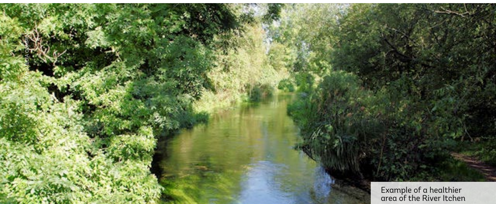
Example of a healthier area of the River Itchen

The project was an overall success and the landowners and catchment officer were impressed with the standard of work delivered. Monitoring is taking place in the catchment to assess the benefits of the tree planting and fencing. This will be a long-term monitoring programme as it is likely to be a number of years before some of the benefits to water quality can be fully assessed. However, it is already evident that the work has reduced the volume of sediment entering the rivers at these sites; a very positive result. A similar project was carried out at the same time within the Teme catchment, where trees were planted in field corners to reduce surface water run off.