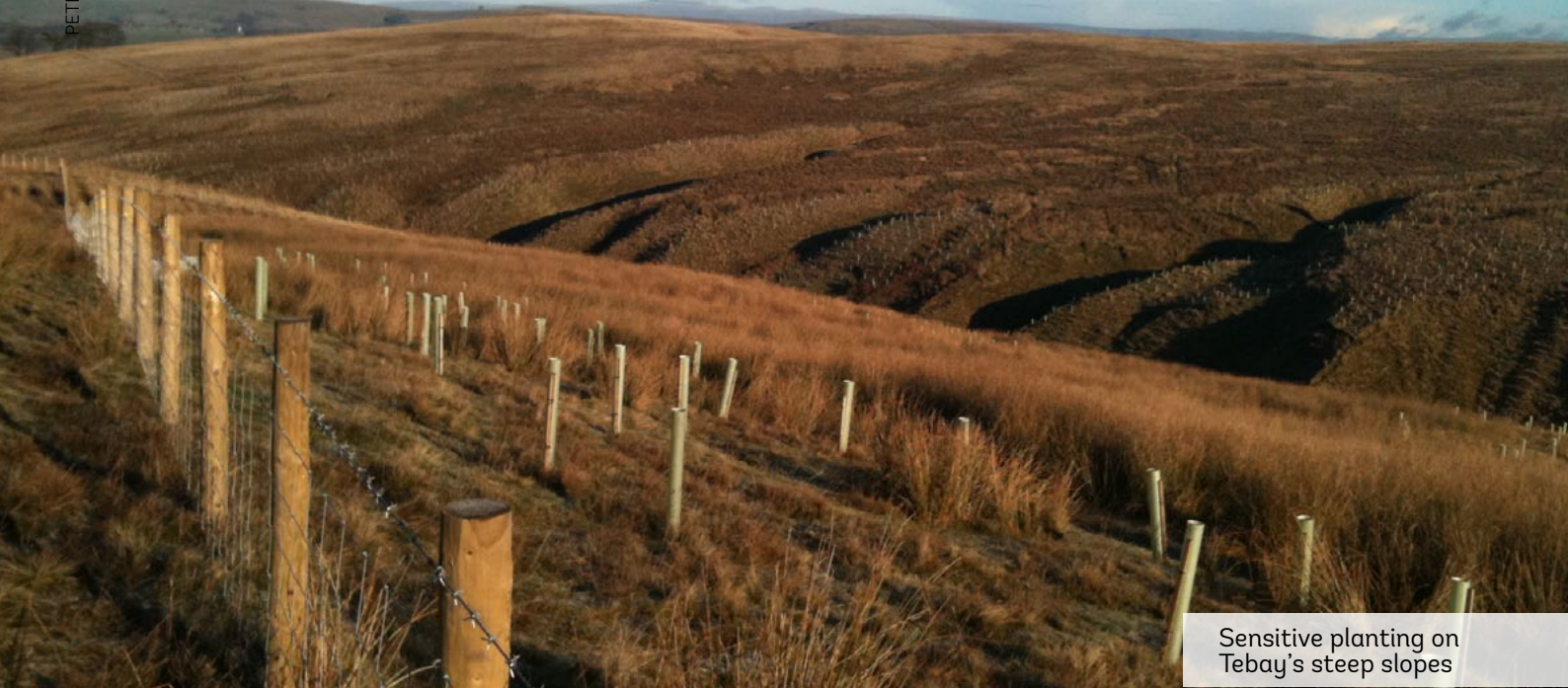
Sensitive planting on Tebay's steep slopes

Tebay common is spread over 1,000 hectares and, although it is privately owned by the Lowther Estate, commoners hold traditional registered rights of commons. The most significant right still used today is access for livestock grazing. Historically commoners would also have had rights to peat (turbary), acorns and beechmast (pannage), wood for house repairs (haybite) and fish from the waters (piscary).