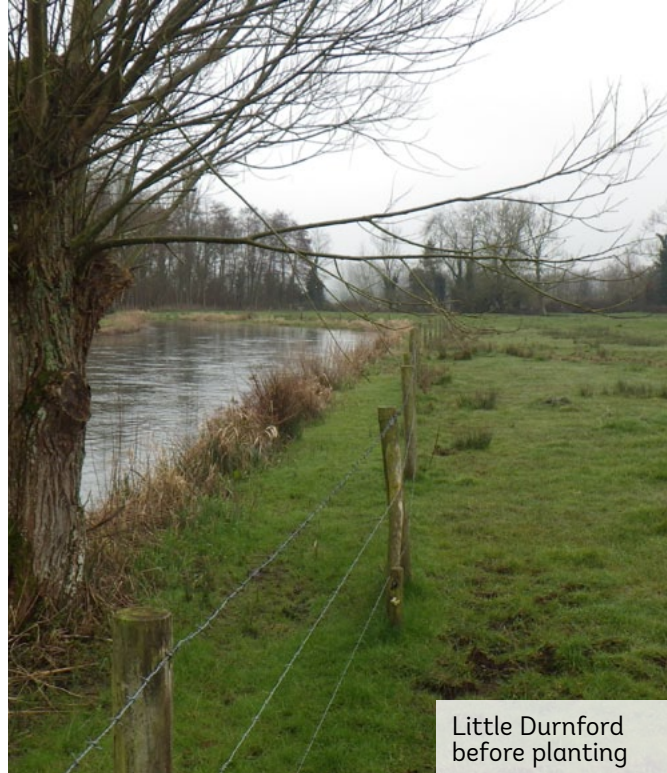
Little Durnford before planting

“I am very happy with what has been achieved and have no doubt it will benefit the river environment without impacting adversely on our anglers. Many thanks.” Vice chair, Salisbury and District Angling Club.