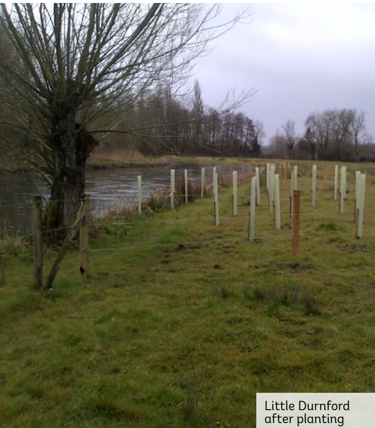
Little Durnford after planting

Stakeholder response is particularly important in the Hampshire Avon, due to the high population density of the area. River users have been pleased with the results of the project: