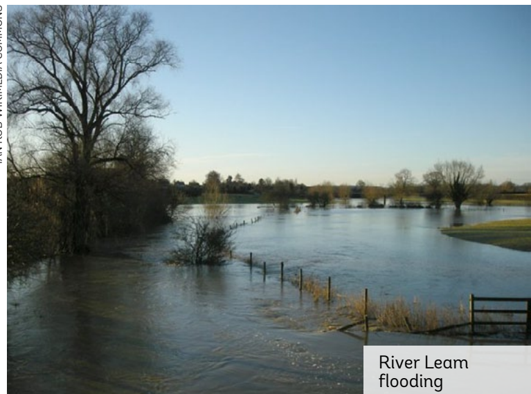
River Leam flooding