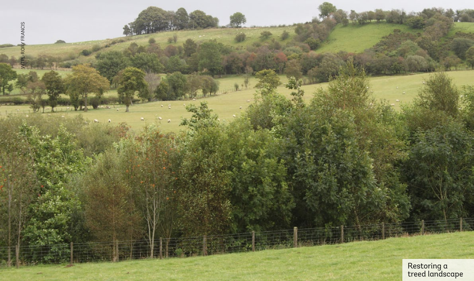
Restoring a treed landscape

The results and the evident benefits of a collaborative approach attracted neighbouring farmers. In 2001 the Pontbren farmers came together as a group of ten, managing a total of 1,000 ha of farmland across the catchment of Pontbren Stream, near Llanfair Caereinion in North Powys, a headwater of the River Severn. The key factor in the success of Pontbren has been the farmers - collaborating as a group, but each remaining firmly in control of the management decisions on their own land.