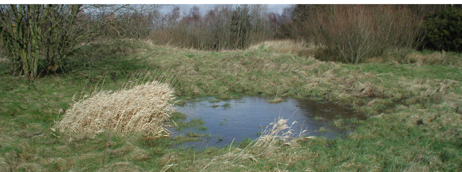
Gorse Covert Mounds