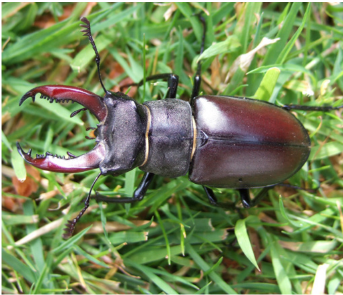
Stag beetle male