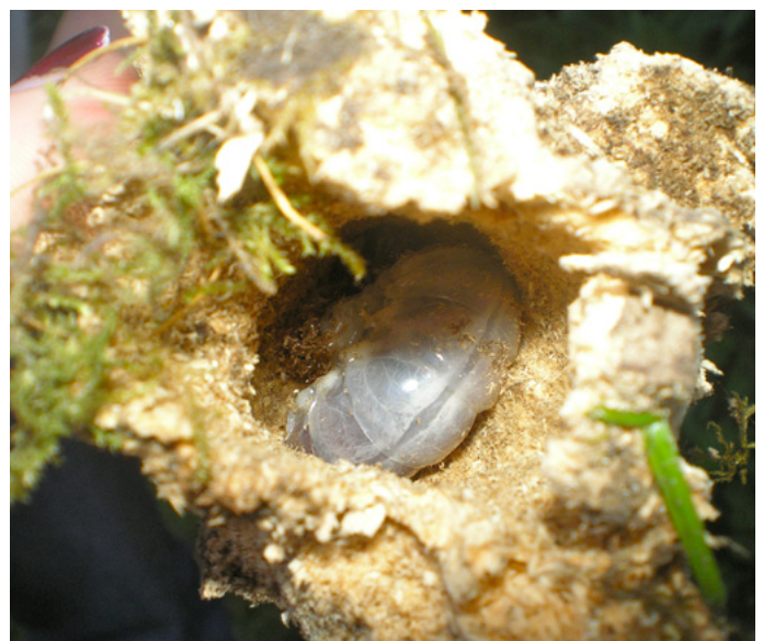
Stag beetle larva