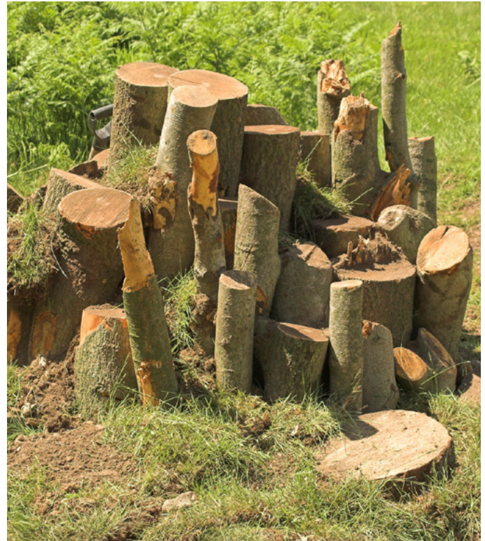
Stag beetle log pyramid

ii PTES (2010) Stepping Stones for Stags . Available online: http://www.ptes.org/files/1871_stepping_stones_final_lowres.pdf