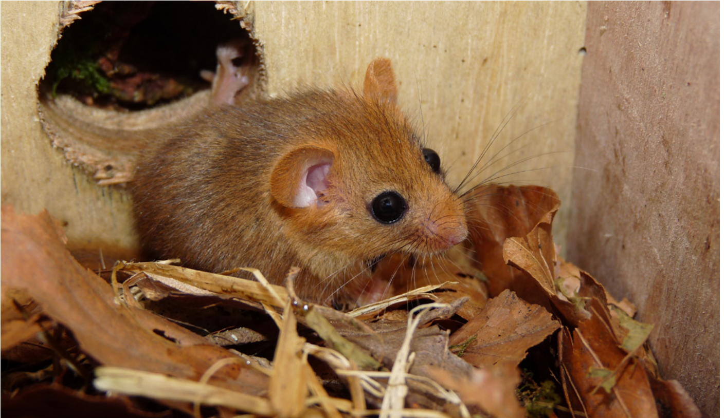
Dormouse in nest box