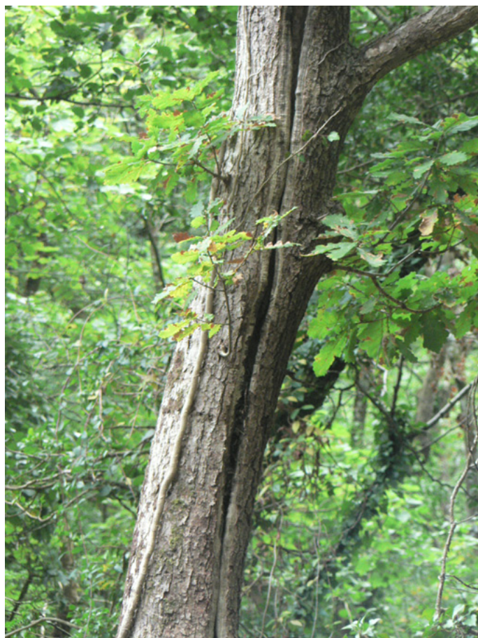
Split fissure roost

Continuous tracking was used to monitor and locate the bats following release, for an average of