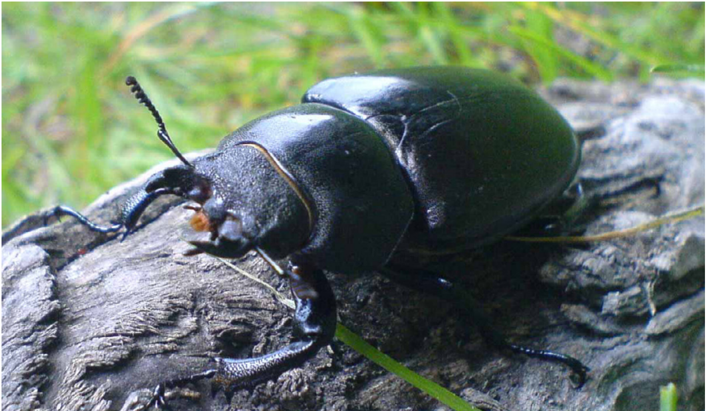
Stag beetle female