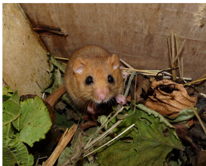
Dormouse in nest box

The National Trust's Stourhead Estate, situated at the meeting point of Dorset, Somerset and Wiltshire, covers a 1,072 hectare (ha) area. This includes around 121 ha of woodland; 60 per cent is native broadleaf, with 40 per cent commercially managed and dominated by conifer (mainly Douglas fir, Pseudotsuga menziesii , sitka spruce, Picea sitchensis , and larch, Larix decidua ). But many of the woodland compartments now comprise a mix of deciduous and coniferous trees, moving away from monoculture systems and increasing nature conservation value.