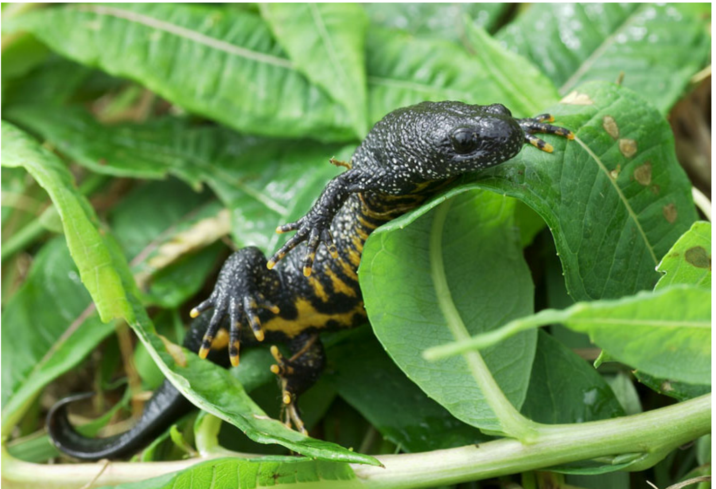
Great crested newt

The great crested newt, Triturus cristatus , is Britain's largest newt and can grow up to 17cm (the females tend to be longer than the males). It is also Britain's most threatened newt. In Europe they are listed in Appendix II of the Bern Convention, Annexes II and IV of the EC Habitats Directive, and are a European Protected Species (EPS). In the UK they are listed in the Wildlife and Countryside Act 1981 and Schedule