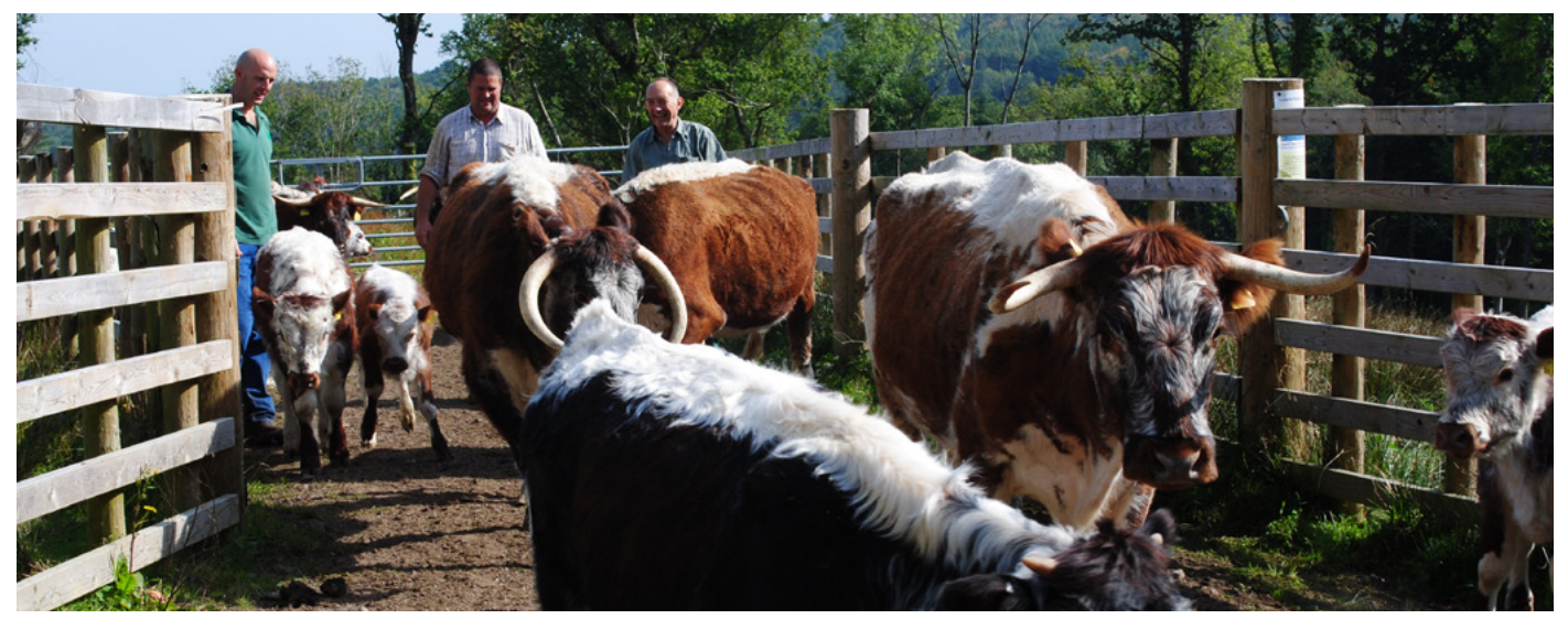
Cattle moving day Neroche Forest

The English Longhorn is an ancient and beautiful breed. Once a Rare Breed, they came close to extinction in the middle years of the twentieth century, but have proved themselves to have a valuable role in conservation grazing. Longhorns thrive on poor, variable forage, are docile and good with the public, and produce high quality beef – making them perfect for Neroche. Regular welfare checks are carried out to ensure the health of the cattle.