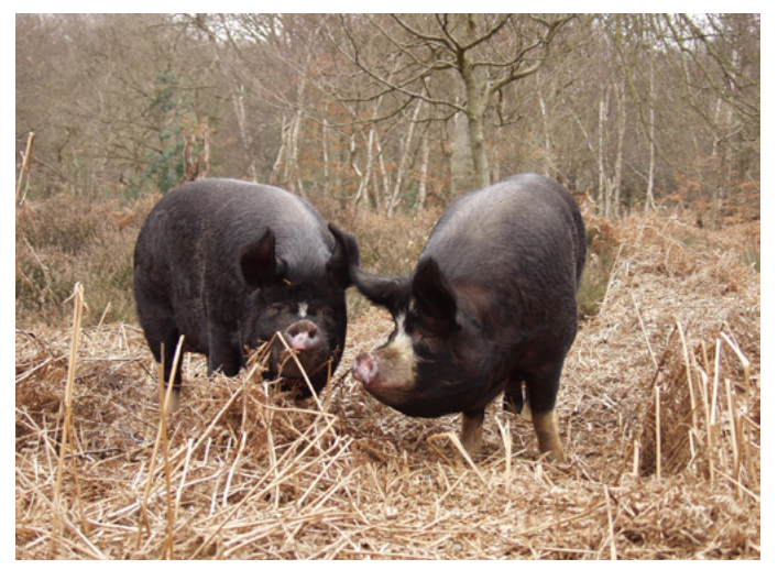
Bracken control by pigs

The pigs were used under the tree canopy as a method of bracken control – an environmentally more sensitive alternative to the use of chemicals and mechanical control. Experiments at Burnham Beeches, Langley and Fairbirch Woods showed the use of pigs to be extremely effective. They also reduced the problem of bracken, Pteridium aquilinum , litter by gathering it for bedding.