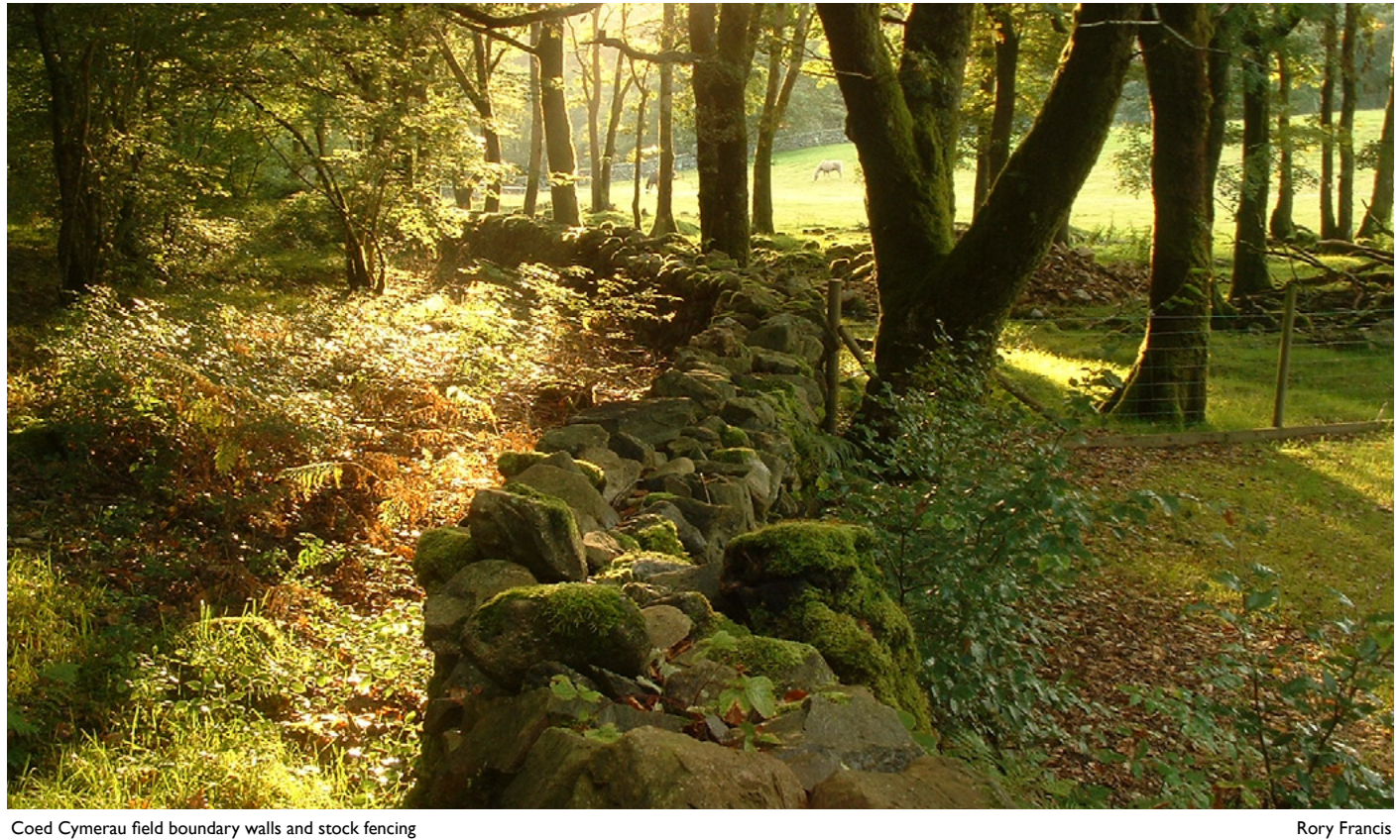
Coed Cymerau field boundary walls and stock fencing

The mesotrophic grassland areas support field woodrush, Luzula campestris, black knapweed, Centaurea nigra, ribwort plantain, Plantago lanceolata, and the moss Rhytidiadelphus squarrosus. There are also pockets of calcifugous grassland containing sweet vernal grass, Anthoxanthum odoratum, and heath bedstraw, Galium saxatile, Several orchid species are found throughout the site, including common spotted orchid, Dactylorhiza fuchsii. The Iowland meadows are Wales Biodiversity Action Plan habitats.