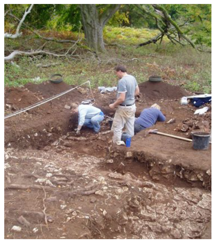
Little Doward hill fort archaeological dig

Parallel to this it was essential to put in place a strategy to ensure that restored remnant limestone grassland flora and developing vegetation was managed in line with the Trust's vision of a matrix of restored, functional habitats. Conservation grazing was considered the most environmentally sensitive method of achieving these plans.