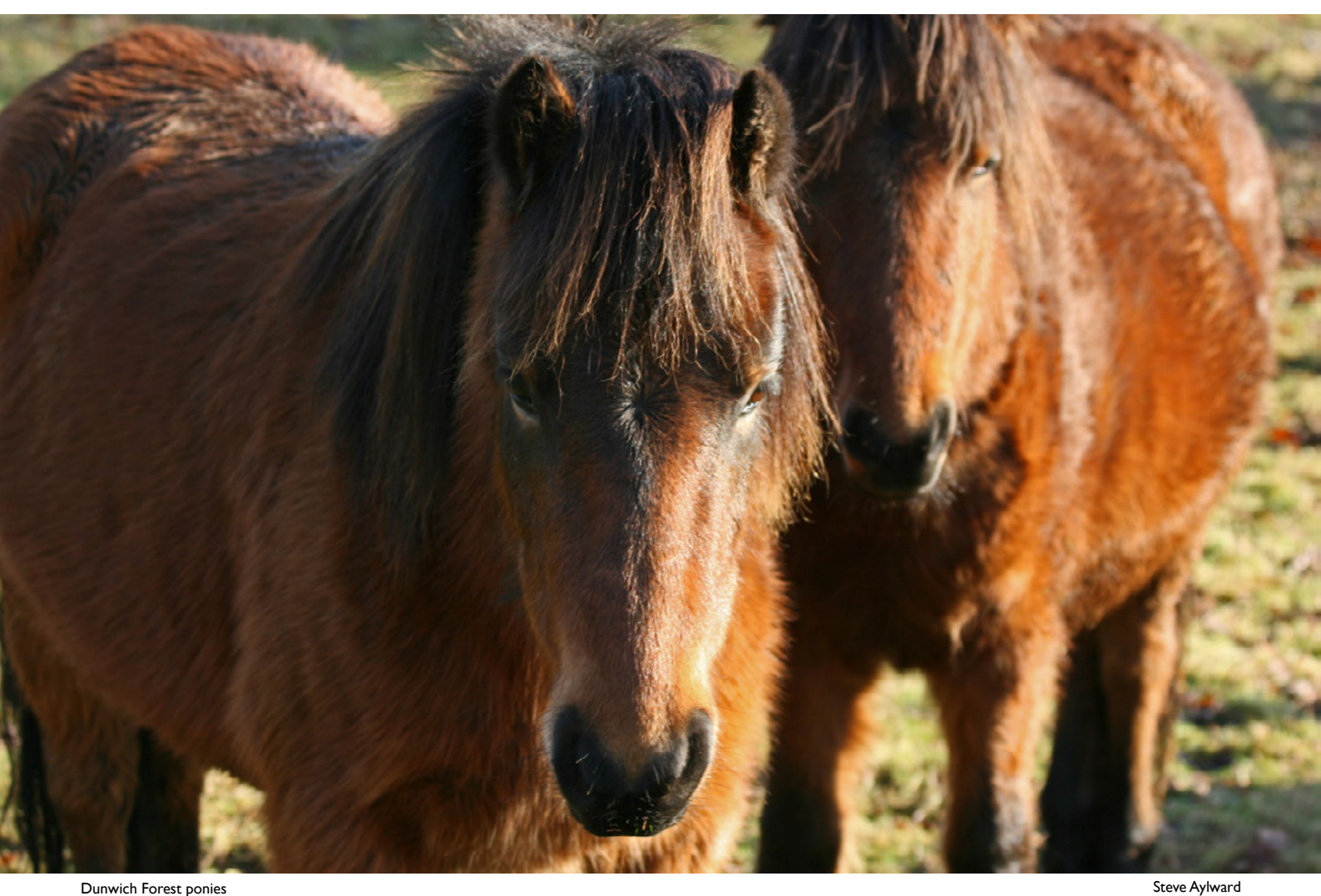
Dunwich Forest ponies

"Grazing and browsing by large herbivores are natural features of woodland ecosystems and grazing management should be considered from the outset, in management of semi-natural and native woods"