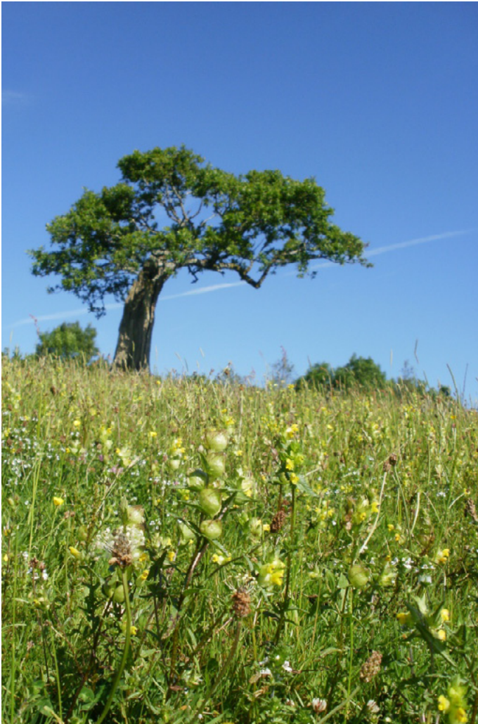
Green Castle, yellow rattle field