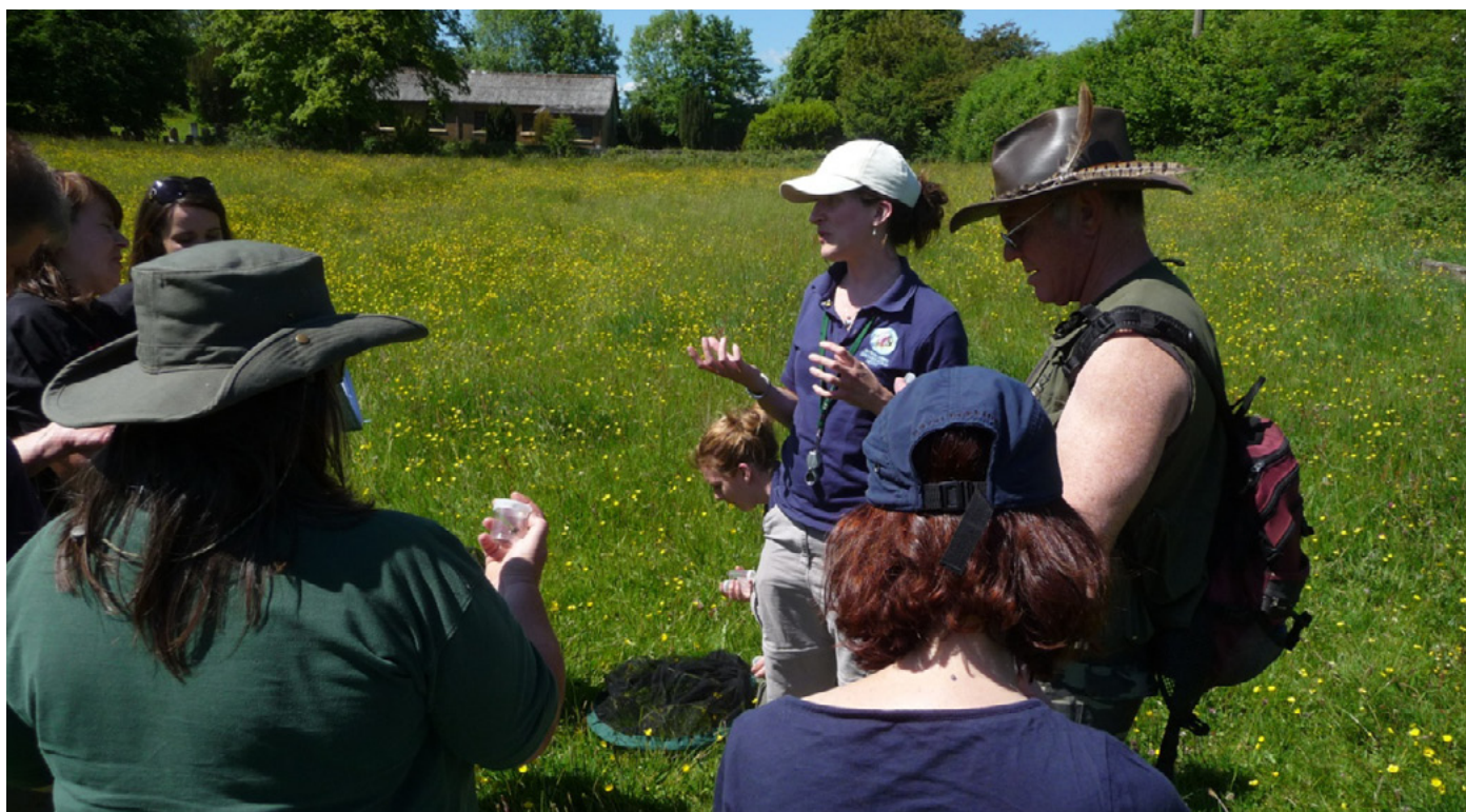
Volunteer training day

Funding from Biffaward, plus a Better Woods for Wales agreement with the Forestry Commission enabled The Grasslands Trust to initiate woodland management in part of the woods. Coppice coupes between 0.1 and 0.35 ha were cut in 2009 and 2010 and a third year of coppice took place in late 2011. Other woodland work includes haloing around some of the older trees, some of which sit on ancient boundaries and may be marker “stubs”. This haloing is necessary because ash is thought to have substantially increased in the woodland over the past decades, while sycamore, Acer pseudoplatanus , and beech, Fagus sylvatica , are also present, albeit in small numbers – they are being removed or left as standing deadwood by chemical thinning. Ash is also being removed from some small experimental areas of the woodland to promote hazel scrub, which is thought to have been a habitat present before large-scale quarrying commenced, according to woodland experts who have visited the site.