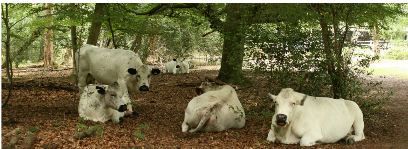
White park cattle in trees

The remaining wood pasture is notable for the pollarded beech, Fagus sylvatica , and oak, both Quercus robur and Q. petraea , trees that once numbered some 3,000 in total.