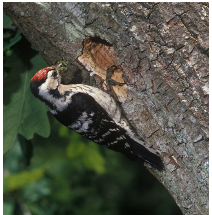
Lesser Spotted Woodpecker

It is a rather forgotten habitat, but recently there has been increasing interest in the restoration and continuation of wood pasture sites.