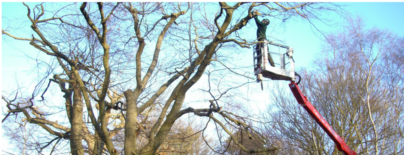
Pollarding with high lift