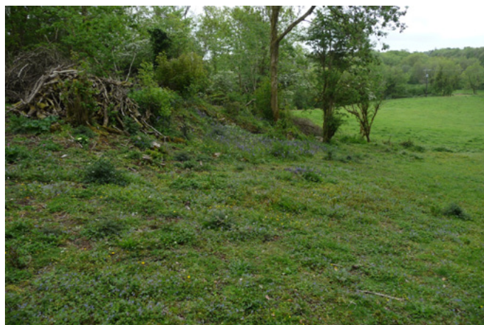
A recently cleared glade next to coppiced woodland

In south-west Wales, The Grasslands Trust is steward of possibly the only example of wooded meadow in the UK, and is carrying out work to restore this fascinating mosaic of habitats.