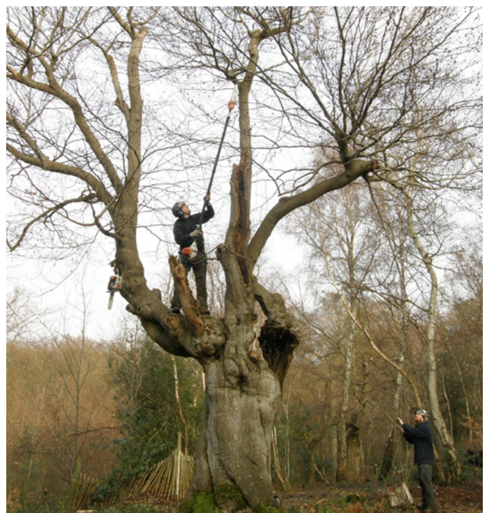
Reduction of an old lapsed pollard.

Excessive desiccation was experienced by a small number of oak pollards in the initial stages of the work, due to the removal of too much surrounding