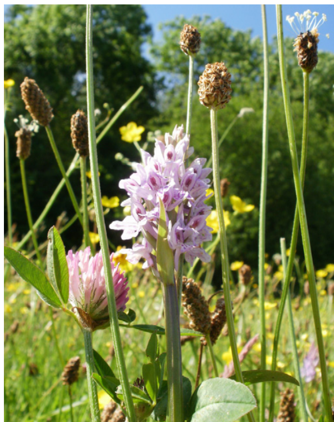
Green Castle, Orchid

The Woodland Trust's Green Castle Woods, Carmarthenshire, has fields whose history and pattern dates back to 1779.