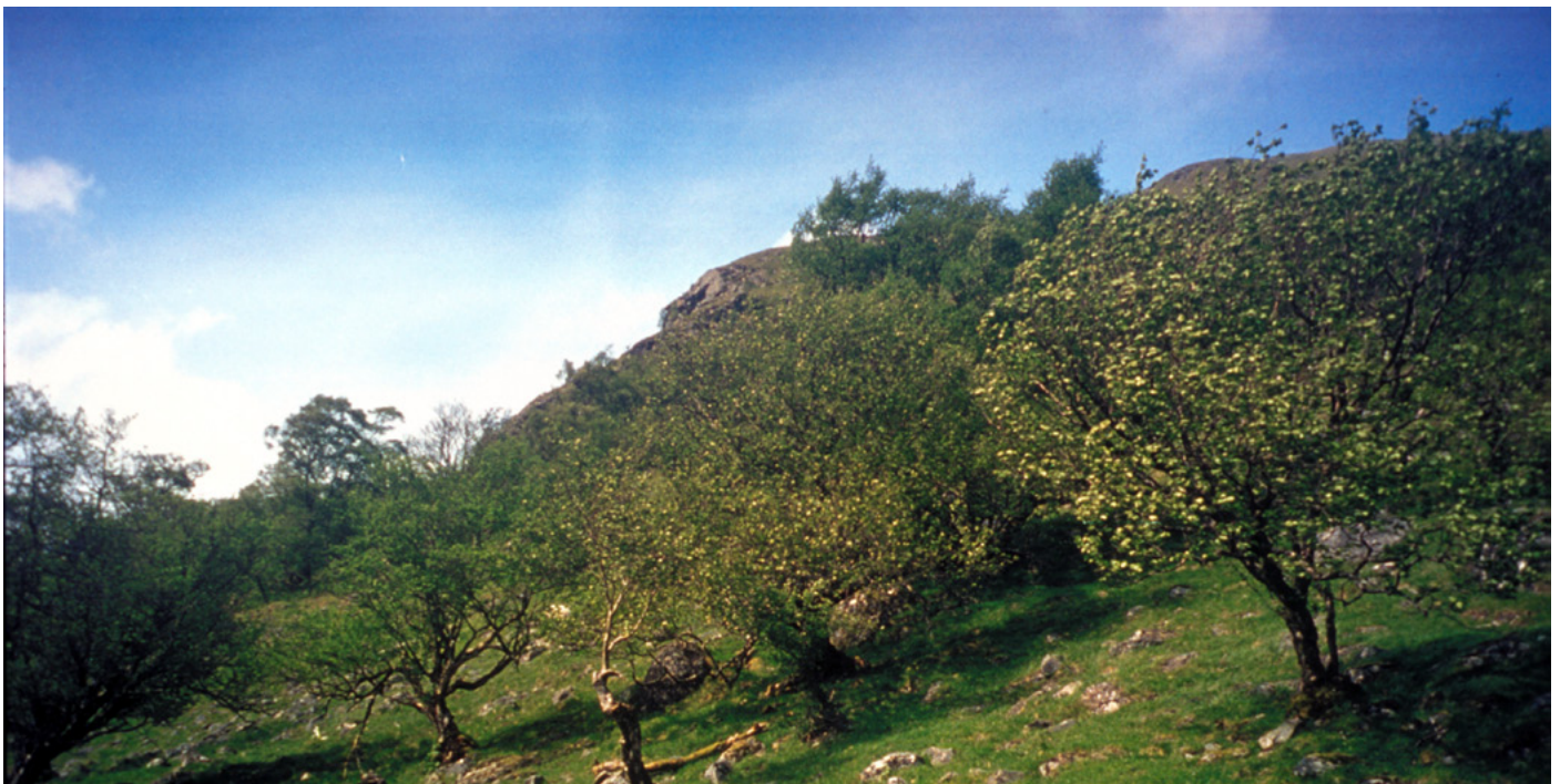
Glen Finglas, wood pasture

Renowned woodland ecologist George Peterken has been to Carmel on several occasions. He recently visited and commented that Carmel may be the only UK example of wooded meadow habitat. Wooded meadows are an internationally important habitat, recognised in the EC Habitats Directive. They comprise small grasslands mown for hay within a larger woodland matrix, with scattered pollards; sometimes the meadows are also grazed. Wood-meadows are mostly found in Sweden and Estonia. Carmel is different in that there are almost no pollards, other than boundary trees.