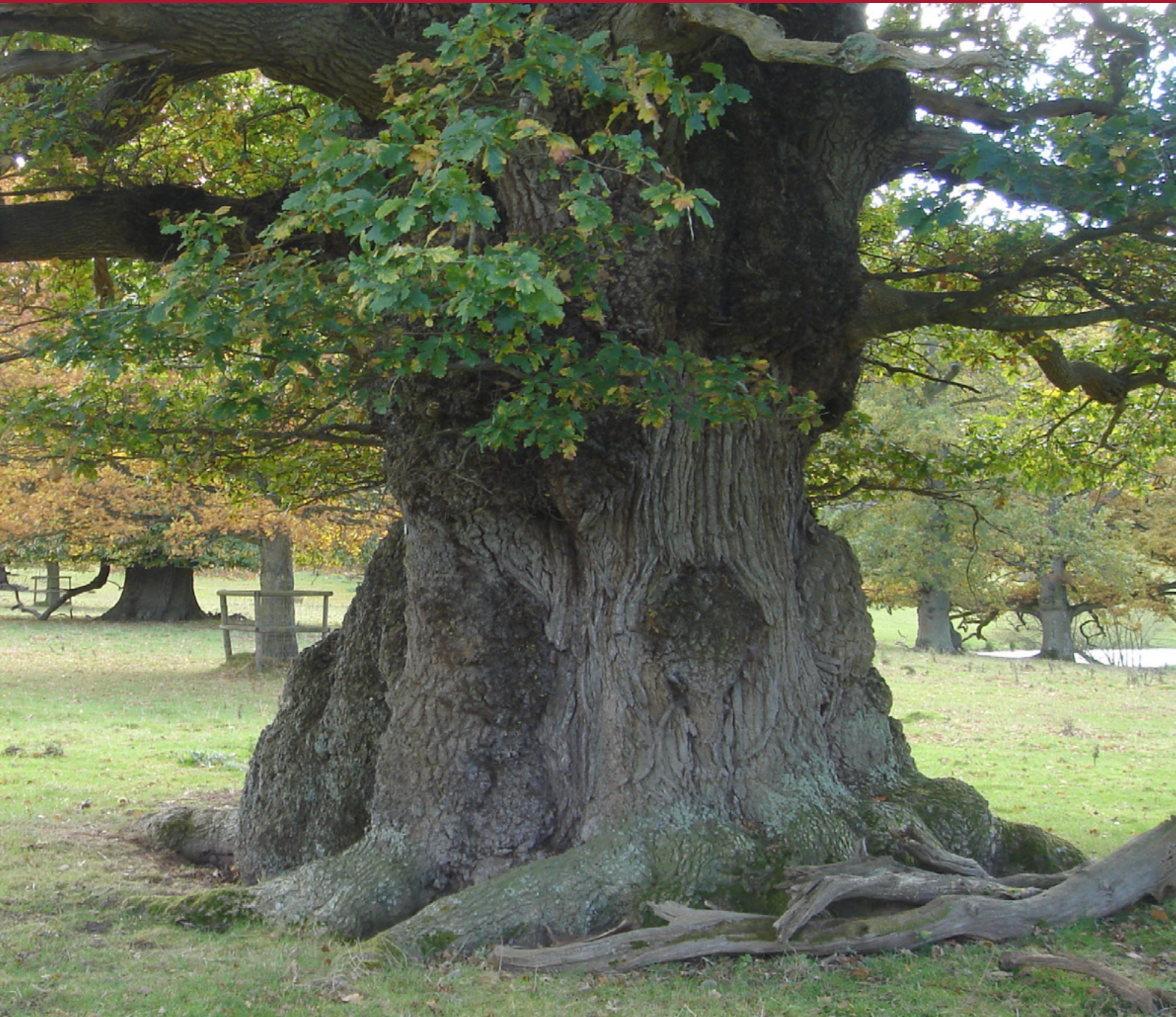
Ancient oak in Moccas Park NNR