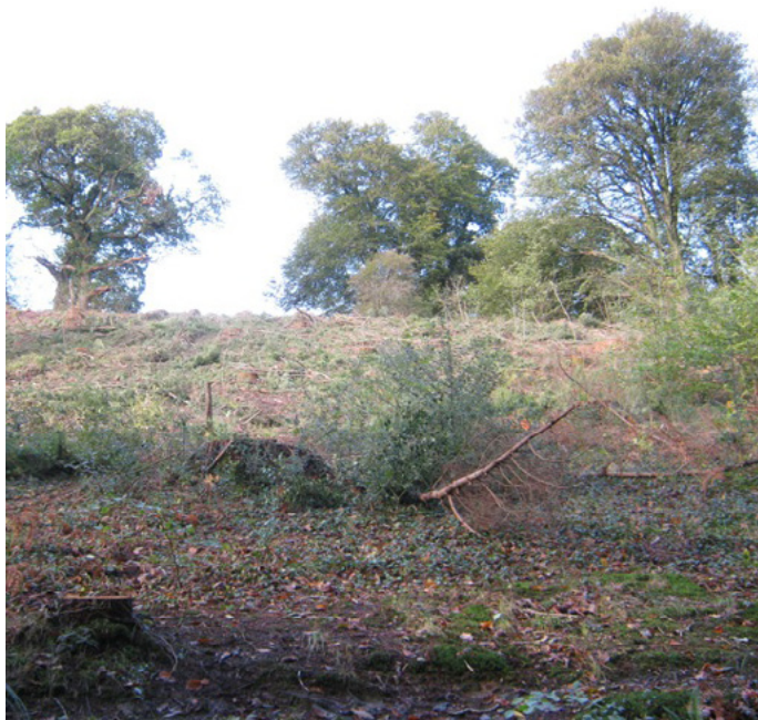
Ethy Park from base – after