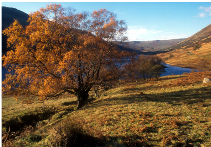
Glen Finglas, pollarded oak