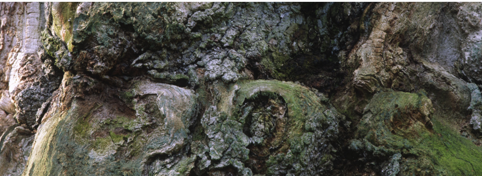
Ancient Sessile Oak