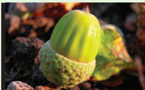
Genes of the future?

It is difficult to determine which species or individual trees may be best able to cope with a changing climate. Our native trees are growing in many other parts of the world despite different climates, latitudes and seasons. It could also be helpful to think of the features of different trees and how these may help them adapt, whether they are native, non-native, broadleaf or coniferous, pollarded or standard.