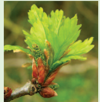
Oak is leafing earlier

Evidence for accelerating climate change has built over the last decade. Global average temperatures have increased from 13.7°C to 14.3°C in the last 100 years. The 1990s was the warmest decade in the last 1,000 years; many ice sheets and glaciers worldwide are retreating and the frequency of floods, droughts and storms is increasing. The populations, ranges, migration patterns, and seasonal behaviour of animals and plants are changing.