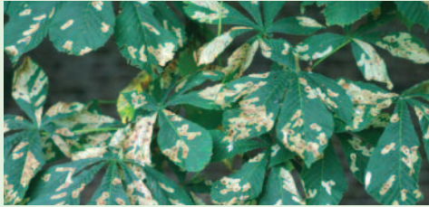
Horse chestnut affected by leaf miner

Knowledge and experience helps identify some of the impacts of climate change on ancient trees, but some things cannot be predicted.