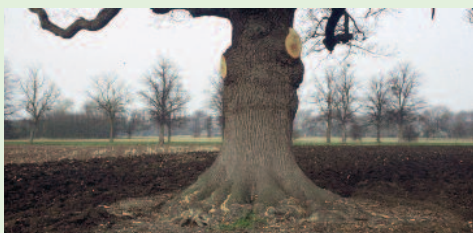
Tree stressed by damage

Pests and diseases are a serious problem in forestry and horticulture and could become a much bigger issue for all trees and woods. As the climate changes the numbers and behaviours of existing pests and diseases will change. New pests and tree diseases may also arrive from outside the UK.