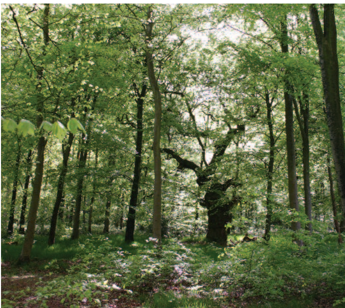
Gradually release ancient trees from overshadowing

Ancient Tree Guides 1 to 3 give more guidance (see back page).