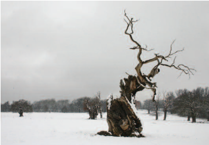
Will ancient trees see snow in a changed climate?

Climate change is happening and it is incontrovertible that much of this is human-induced. Temperatures are rising and rainfall patterns are changing in different ways across the UK. But in addition to the incremental pattern of change over time, there are irregular extreme events, such as floods, drought and gales.