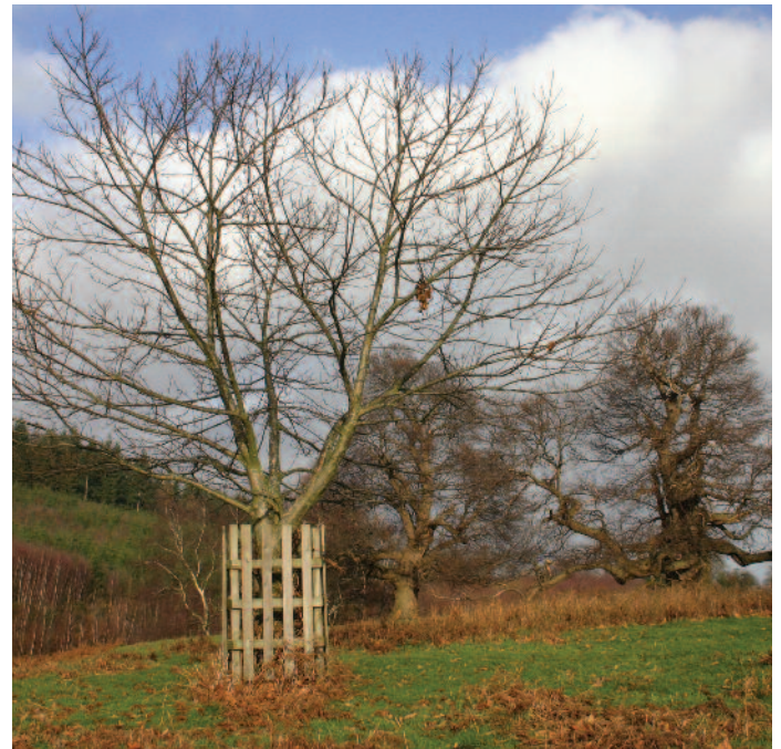
Planting future ancient trees