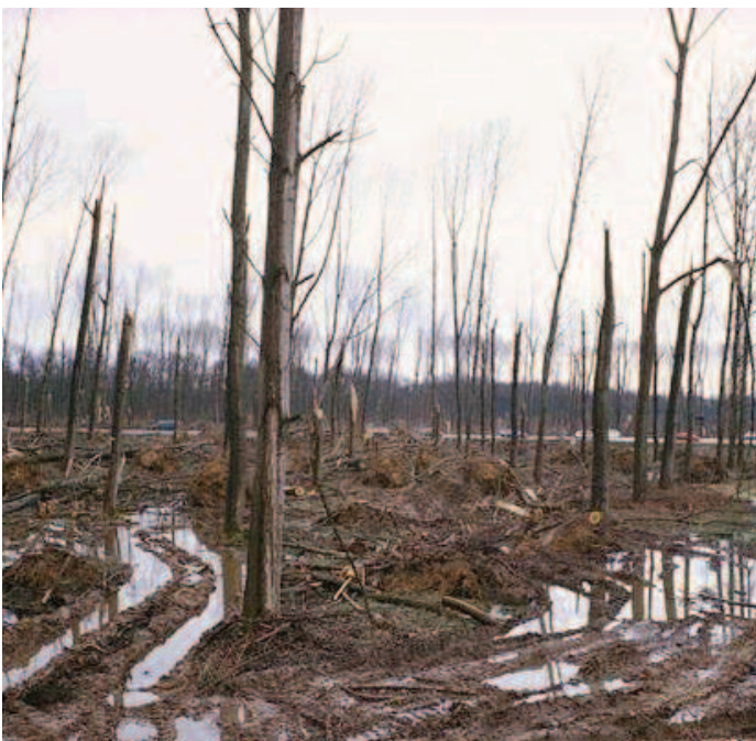
Young trees damaged by the 1987 storm...