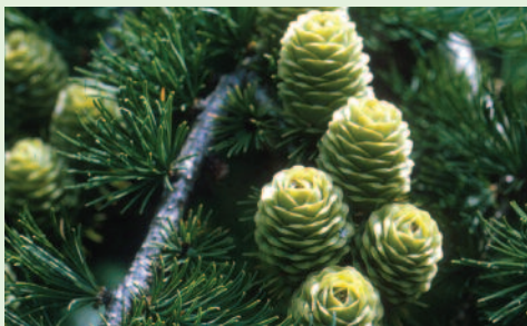
Will non-native trees be able to cope?

Ancient trees which are under stress may lack the ability to respond to damage and put out new growth. Stresses induced by the effects of climate can add to other pressures which ancient trees face. However trees often show surprising resilience.