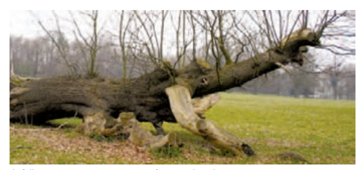
A fallen tree may regenerate if given the chance

"We should do everything we can to prolong the lives of ancient trees. They are witnesses to the past, survivors in historic landscape; each has its own significant story. 33