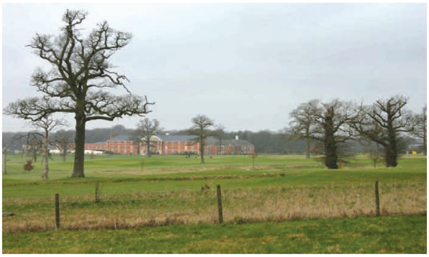
On the other side it has been converted to a golf course. As many of the old trees have been incorporated into the design, it is possible to maintain and enhance the continuity of the landscape by caring for the trees and planting for the future.