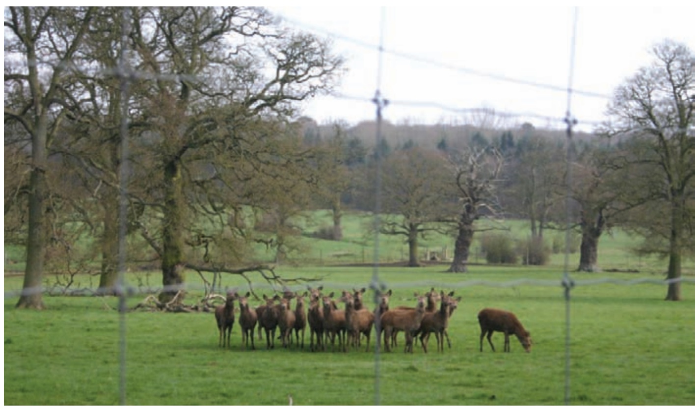
Whittlebury Park is divided by a main road. One side of the road is still an historic deer park designated an Site of Special Scientific Interest