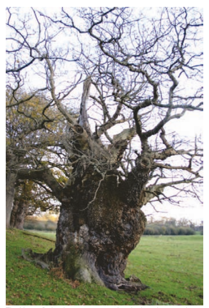
This Moccas Park oak was at one time thought the only tree in the country that was host to a particular species of beetle