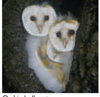
Owl in hollow tree