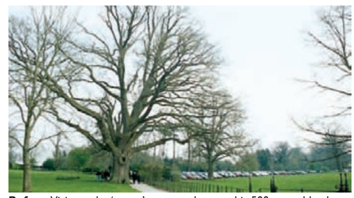
Before: Visitors, the 'target', are too close to this 500 year old oak