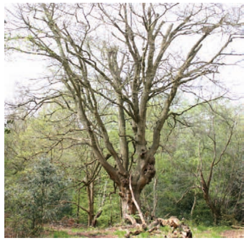
Crown retrenchment may prolong a tree's life