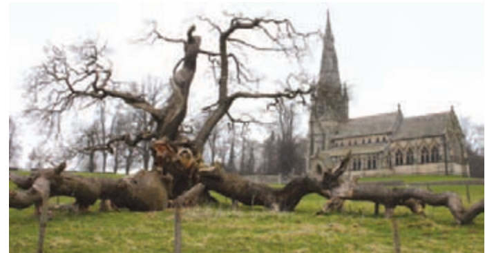
Leave limbs where they fall

Ecosystems rely on the recycling of nutrients from fallen wood by micro-organisms. Such wood should be retained as close as possible to where it has fallen. It can then slowly decay back into the soil and the nutrients become readily available for the tree to reuse.