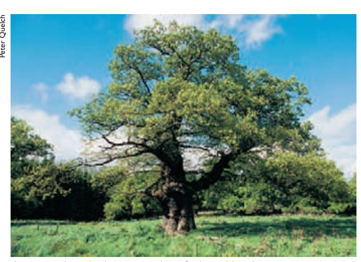
Ancient oak in the historic park at Cadzow, Hamilton

The registers and other inventories of parks and gardens in the UK record designed landscapes of special historic interest and include many different types of sites. Registered designed landscapes are of national significance and as such are a material consideration for local planning authorities in determining planning applications. The oldest surviving parks and gardens are likely to be considered for inclusion on the registers, and later Georgian and Victorian parks if they are representative of an important design and relatively intact. Specimen trees, shrubberies, parkland clumps, shelter belts and woods may all be features of designed landscapes.