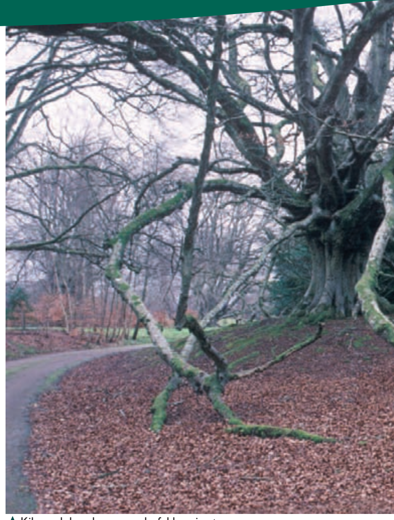
▲ Kilravock beech – a wonderful layering tree

The great landscape designers – William Kent, Capability Brown and Humphry Repton, as well as less well-known ones, frequently incorporated into their plans features the pre-existing landscape of mature and ancient trees such as old hedgerow trees and pollards. Many of those original trees still thrive today and because of their increasing age have become of even greater historic significance. This guide provides information and advice for those restoring, conserving and farming designed landscapes with ancient and ageing trees. It is intended for landscape designers and gardeners, owners and property managers of historic parks and gardens as well as their agents and advisers. It should be read in association with the first guide in this series "Ancient Trees Guides No.1: Trees and farming" because some farming activities can have a significant impact in historic parks too.