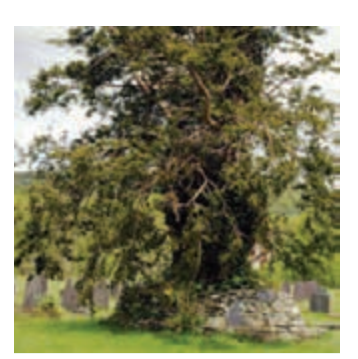
Churchyards, are a stronghold for ancient yews such as this one at Strata Florida in Wales, said to stand over the burial site of Dafydd ap Gwilym.