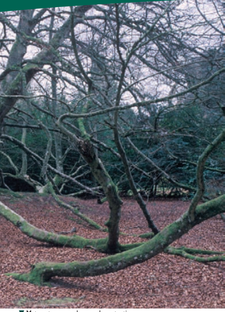
Mature trees need as much protection as the young trees planted to replace them

In the 16-19th centuries when most of our historic parks and gardens were designed, the British countryside was far richer in old and ancient trees than it is today. Recent changes in agriculture and the decline in the value of 'working' trees, especially pollards and coppice have led to many losses. Dutch elm disease resulted in the disappearance of millions of mature and ancient elms. Fortunately storms, like the one in 1987, often have less of an effect on our oldest trees than younger ones because they have already lost their crowns.