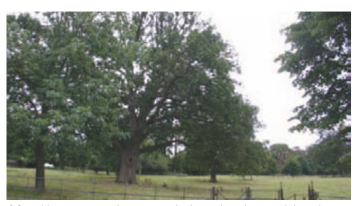
After: Visitors are no longer at risk, the path and car park have been relocated.