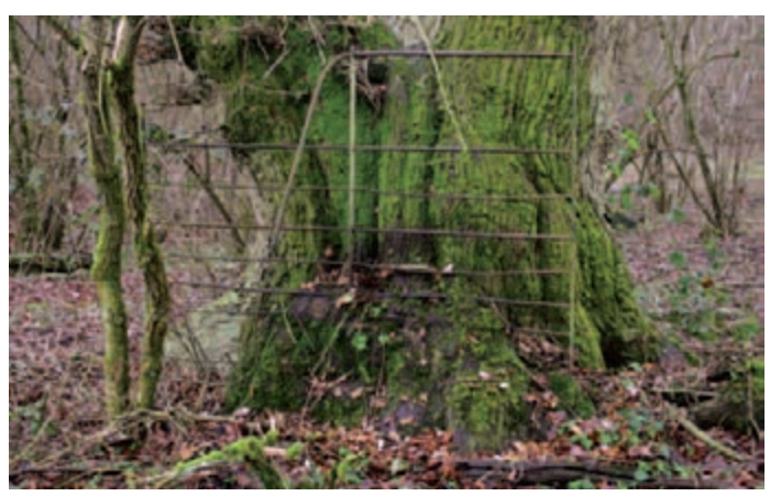
Remnant iron railing embedded in an ancient oak

The designers and managers of the original historic landscapes did not have to contend with the damaging effects of 20th-century farming, forestry and game management or development such as new leisure facilities or to cater for the use of cars. They did however often consider the impact of grazing animals. Many individual landscape trees and clumps were originally fenced, often with iron railings. Large numbers of these railings are said to have been removed as a source of scrap metal during the Second World War and at the same time many herb-rich parkland grasslands were cultivated for arable production.