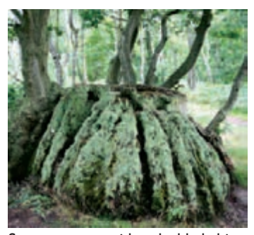
Stumps can provide valuable habitat