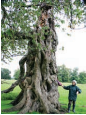
The fattest cherry in the UK