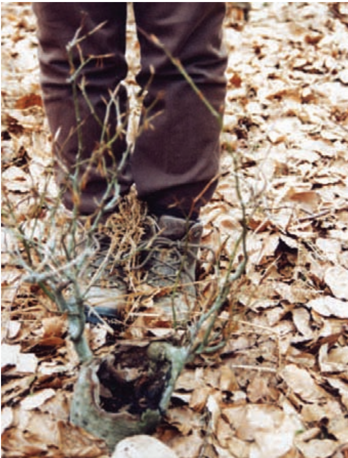
Not all veterans are ancient: a tiny veteran beech tree