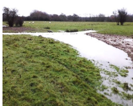
Figure 2. Scrapes before (left) and after (right) rainfall