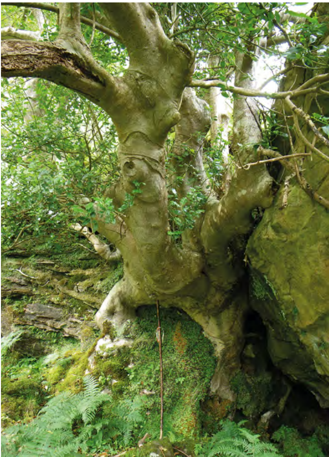
A rare veteran holly in the rainforest.