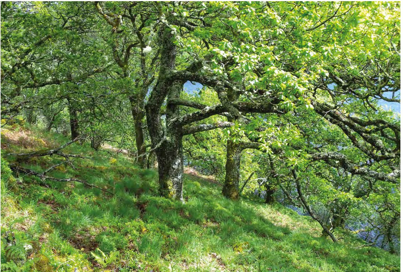
Atlantic oak wood pasture

All habitats on the west coast of Scotland need to be looked after to ensure a future for our rainforest.