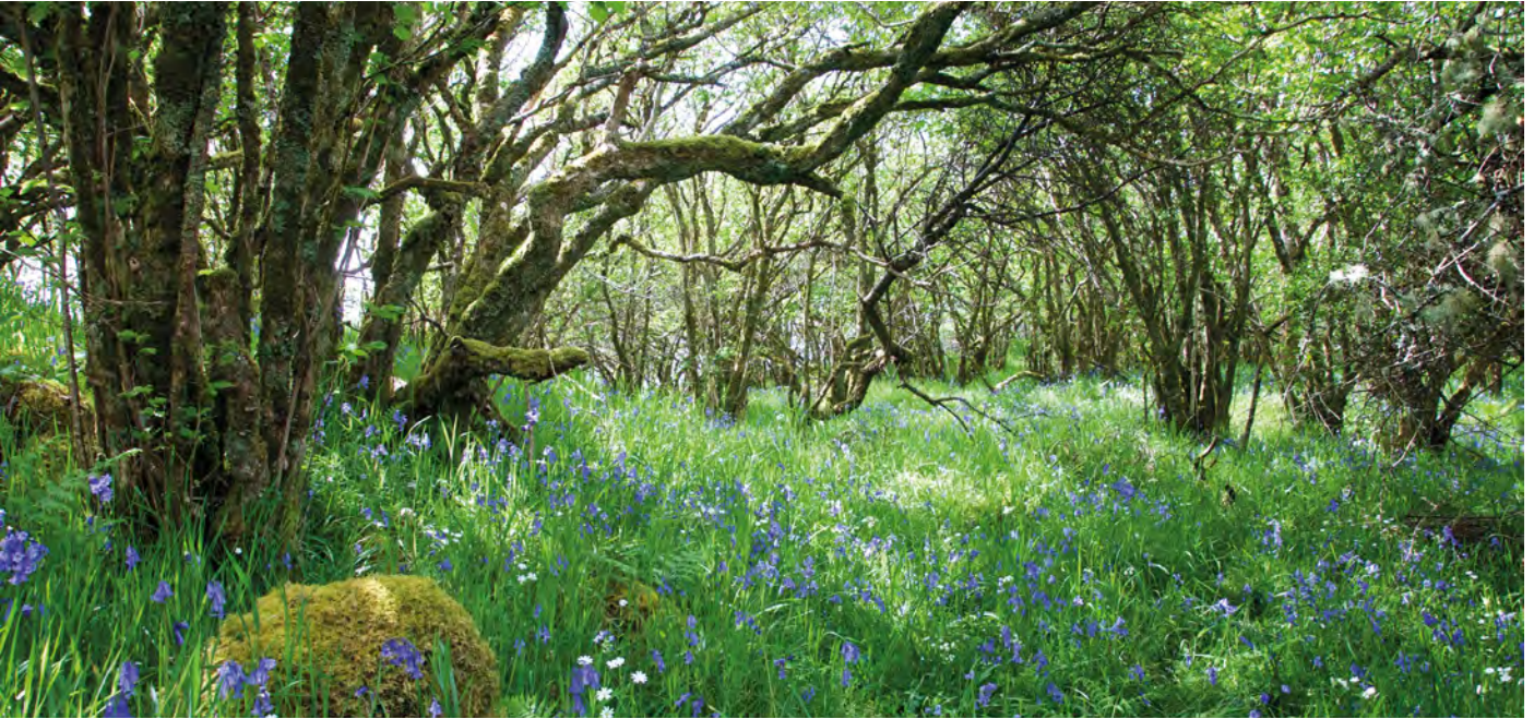
Ballachuan Hazelwood, Seil, Argyll