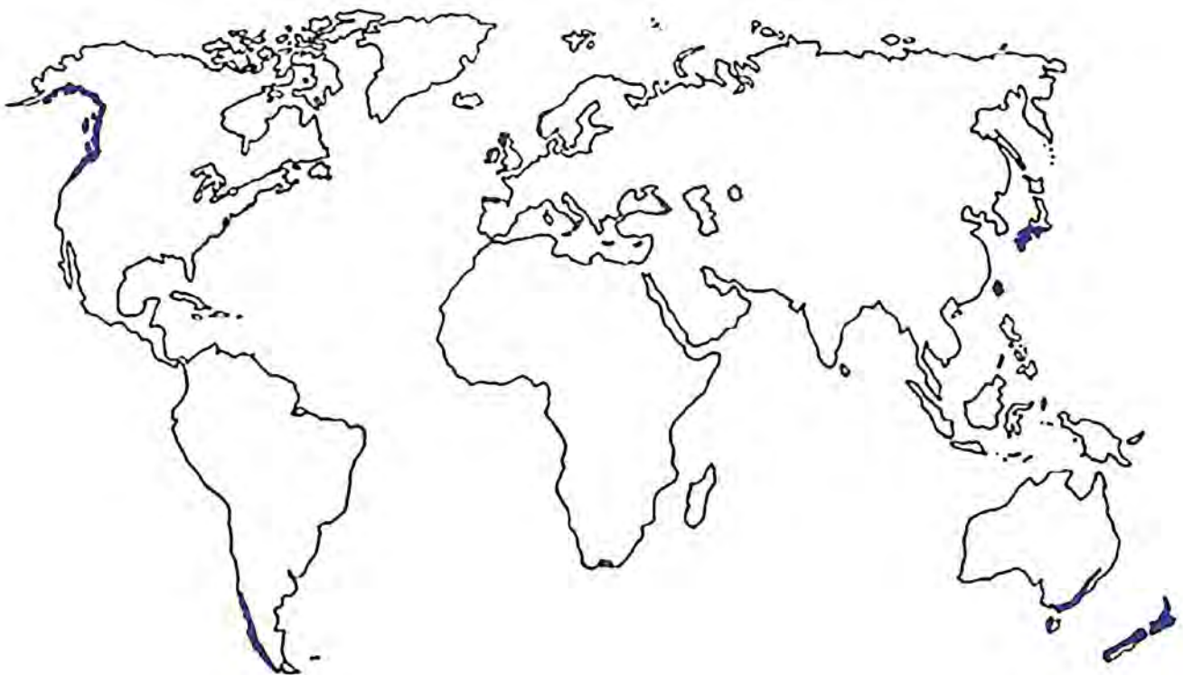
Hyper-oceanic climates, and therefore the extent of temperate rainforest, are very limited globally as illustrated in this map from Averis et al. (2012).

Along with the climate and the clean air, people have also shaped these ancient woodlands through managing, and sometimes removing them, over thousands of years. Temperate rainforest used to occur more widely along the Atlantic coastline of Europe, but now only fragments of the original habitat persist in areas where it has been valued as woodland or where there has been less pressure to clear the forest for other purposes. The wildlife it holds is significant to our own history, culture and economy. It is also one of the world's rarest habitats, which we have a global responsibility to look after.