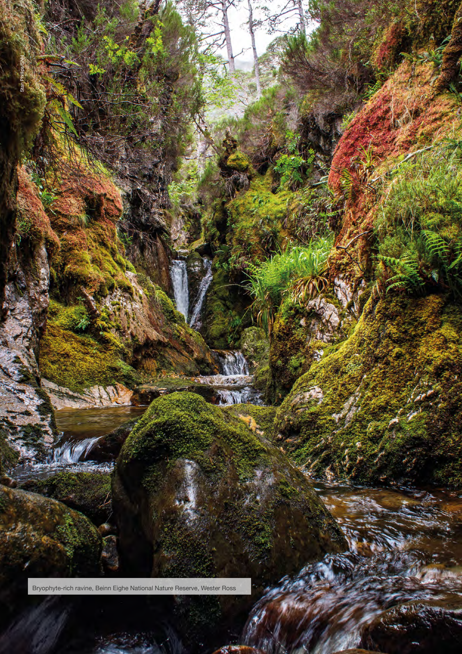
Bryophyte-rich ravine, Beinn Eighe National Nature Reserve, Wester Ross