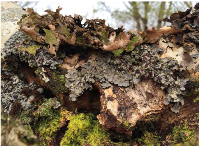
Rassal Ashwood National Nature Reserve, Wester Ross

resistant seedlings and saplings must be able to grow into mature trees to ensure that the woodland as a whole is resistant. By encouraging the regeneration of ash, and protecting it from other threats, we can give it the best chance of developing resistance to the disease in the long term. Other tree species, such as hazel, rowan and aspen, support many of the lichens that occur on ash, so promoting regeneration of these species will help to safeguard epiphytic species as ash declines.