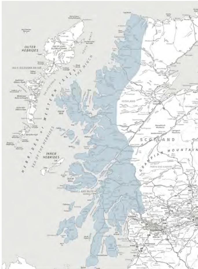
Rainforest zone of the west coast of Scotland

Map © Crown Copyright 2015. All rights reserved. Ordnance Survey