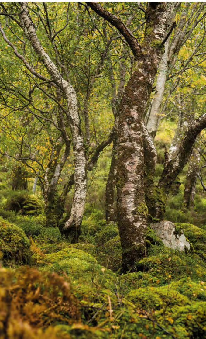
Birch woodland, Wester Ross.

Atlantic oak woods are often considered the archetype of Scotland's rainforest, but it is clear from the data that in fact birch trees and birch woodland dominates. Birch woods make up a third of the area whereas oak woods make up only a fifth. Birch dominates because it is a prolific seed producer, and the seedlings are less palatable to grazing animals than those of oak or ash, so they are more likely to develop into saplings and young trees. The rainforest also includes other native woodland types like wet woodland, ash woods and native pine woodland. The western-most native pinewoods are under-represented in known rainforest sites, but that may be because we have less knowledge of the sorts of oceanic wildlife they support. There are also almost 500 hectares of hazel wood within the known rainforest area and a further 1,500 hectares on the west coast that might contain rainforest wildlife. Until recently, hazel wood was not widely recognised as a distinct woodland type, but it is a significant component of the rainforest because of the diverse epiphytic communities that it sustains. See appendix 2 for some of the data used in this analysis.