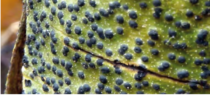
Pyrenula species growing on Atlantic hazel.

Britain is home to more than 1,000 species of bryophytes (mosses and liverworts) (Natural History Museum, 2018). This makes up around 60% of Europe's flora and 5% of the global flora (Gibby, 2003). Within this diverse group, bryophytes found in the temperate rainforest are of particular importance in international terms. UK rainforest bryophytes rival those found in the tropical montane cloud forests of Latin America, Africa, south-east Asia and the Caribbean.