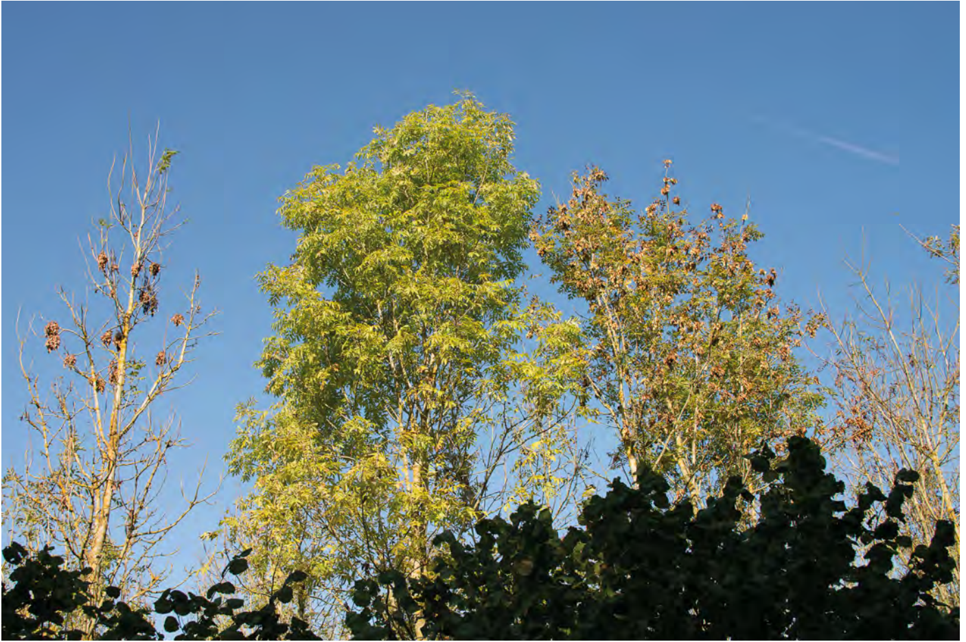
Ash trees with chalara

Pests and diseases also pose a threat to the health and resilience of the rainforest. Ash is an important part of the west coast landscape. It has a less acidic bark than many other trees, and is therefore favoured by a subset of characteristic rainforest epiphytes, especially cyanolichens. Its importance as a host tree for epiphytes has been increased by the widespread loss of elm. Ash is now threatened itself by Chalara dieback. A level of resistance has been found in all populations studied, but