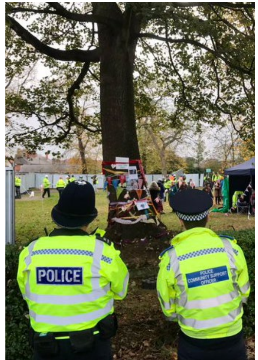
A protest against the proposed felling of urban trees in Newark, to make way for a car park extension. The trees were saved.

Major efforts to involve communities in urban forestry date back to the 1970s and include the creation of NGOs like Trees for Cities, the Community Forests, city-wide tree planting campaigns, community tree nurseries and day-to-day consultations with residents by tree officers. Charities like the Woodland Trust also involve local communities with management of urban woodlands. High profile protests about the felling of urban trees have underlined the importance of involving communities in decisions about urban tree management, but cuts to local authorities have compromised their ability to do this. A few local authorities employ staff in community forestry roles to undertake this type of public engagement work alongside tree planting.