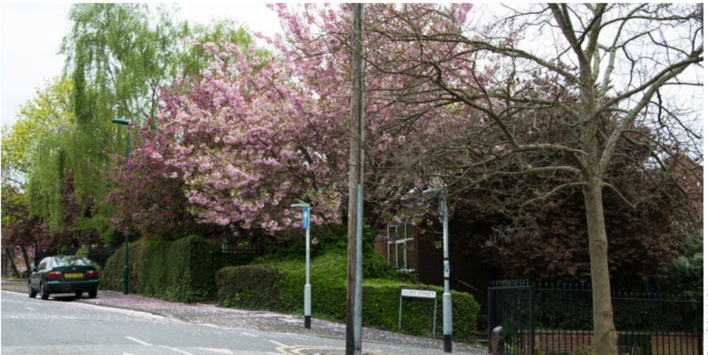
Urban treescape, Nottingham.

We ensure that every tree we sell, plant or fund is sourced and grown in the UK or Ireland. Our UK and Ireland Sourced and Grown (UKISG) scheme is the most reliable source of these trees. This is an audited standard that ensures the trees origin, thereby reducing the likelihood of importing tree pests like oak processionary moth, or disease. An increasing number of nurseries are now supplying UKISG trees, including larger standard trees. To minimise the risk of importing tree pests and diseases, only trees that have been sourced and grown in the UK or Ireland should be planted and we encourage purchasers to specify UKISG accreditation when buying trees. To boost availability, government should ramp up investment in domestically sourced and grown urban trees, supported by skills training to create sustainable jobs.