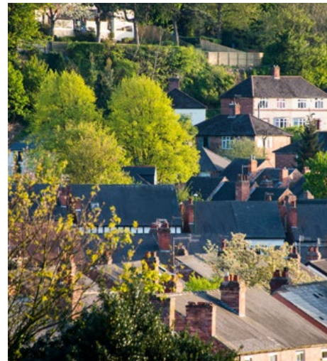
Urban treescape, Nottingham.

Urban trees can create disbenefits for people and responses to these can threaten urban trees. These disbenefits include allergic reactions to tree pollen, structural damage to built infrastructure from roots, and the production of Volatile Organic Compounds (VOCs). VOCs can contribute to the formation of smog and ozone which have negative health impacts. Most trees near buildings don't cause any damage, but in some cases, tree roots can be linked to subsidence. Insurance claims relating to subsidence and damage from tree roots can be a major cause of tree removals, particularly in areas with clay soils. Shading, whilst generally providing benefits, can in some circumstances be a disbenefit. These kinds of issues alongside others like leaf litter, mess from birds roosting and nesting, and the perception of crime in woodlands can result in negative perceptions by some members of the public. These disbenefits and negative perceptions can be minimised through good design, choice of tree species and effective management.